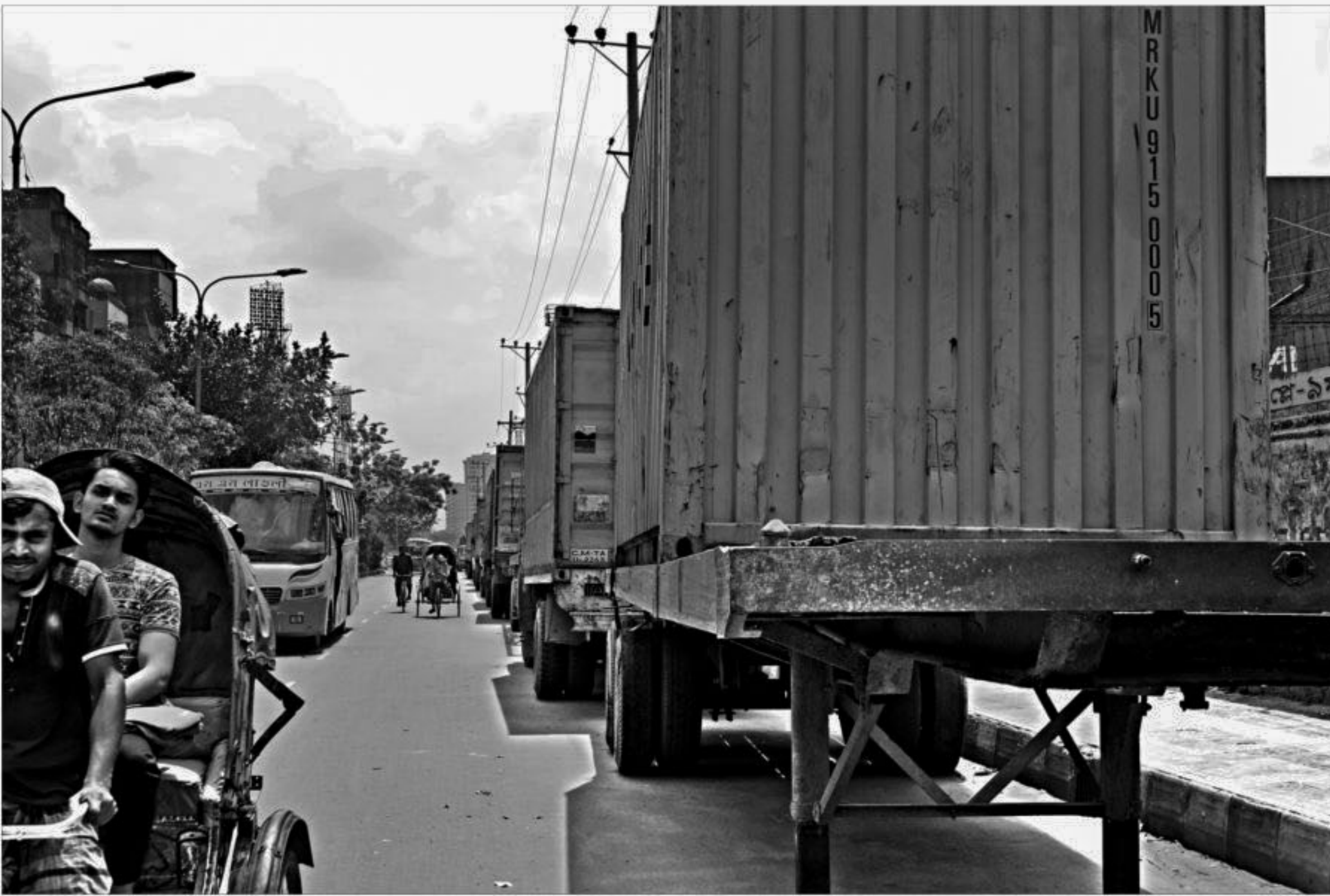
A good part of this road next to the inland container depot in the capital's Mugdapara area remains occupied most of the time by parked cargo trucks and semi-trailers, causing traffic congestion during rush hours. The photo was taken on Atish Dipankar Road on Thursday.