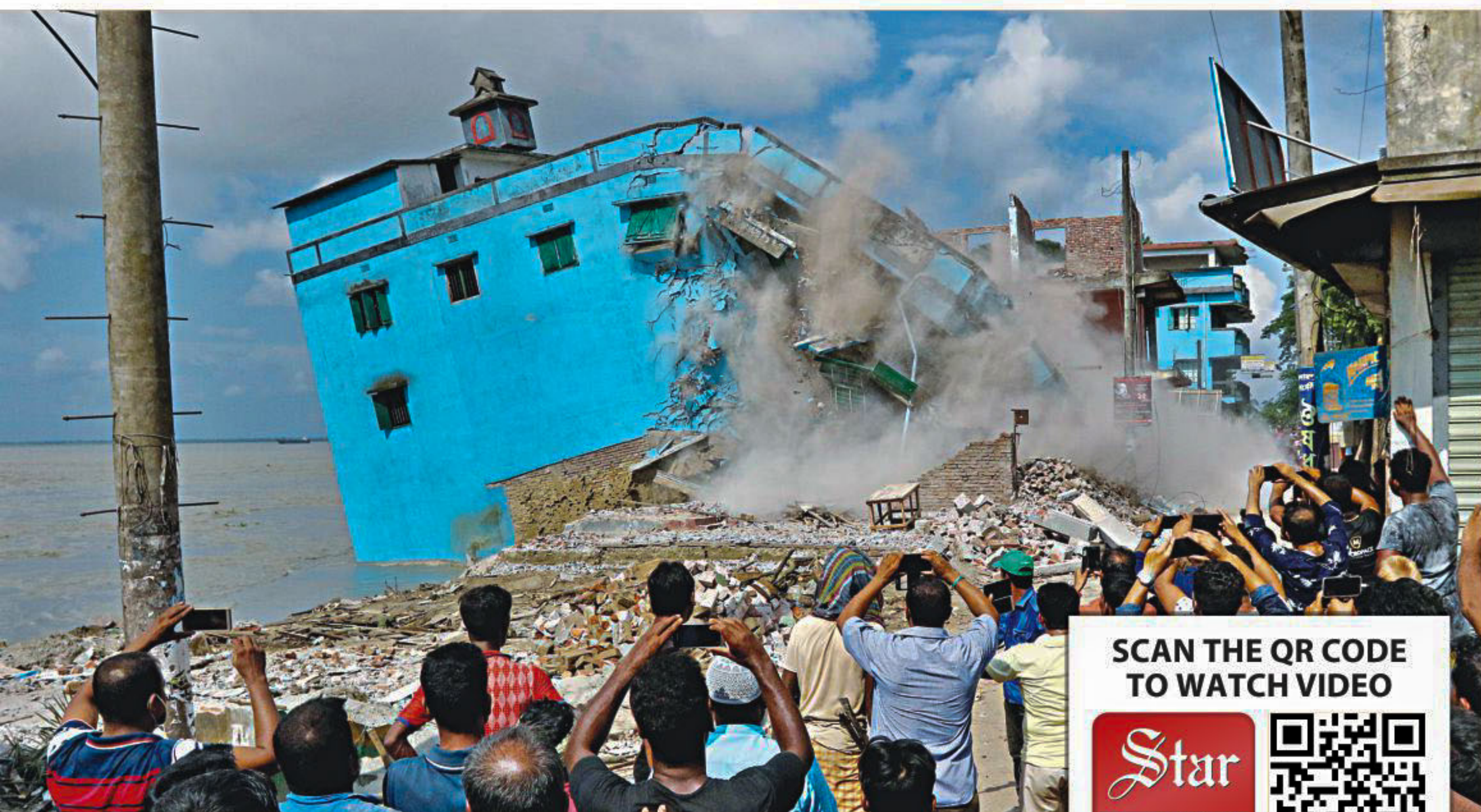
The Padma devours a three-storey building in Shariatpur's Naria upazila on Monday. Erosion of the river bank has taken a serious turn in the area recently as houses, shops and roads have been engulfed.