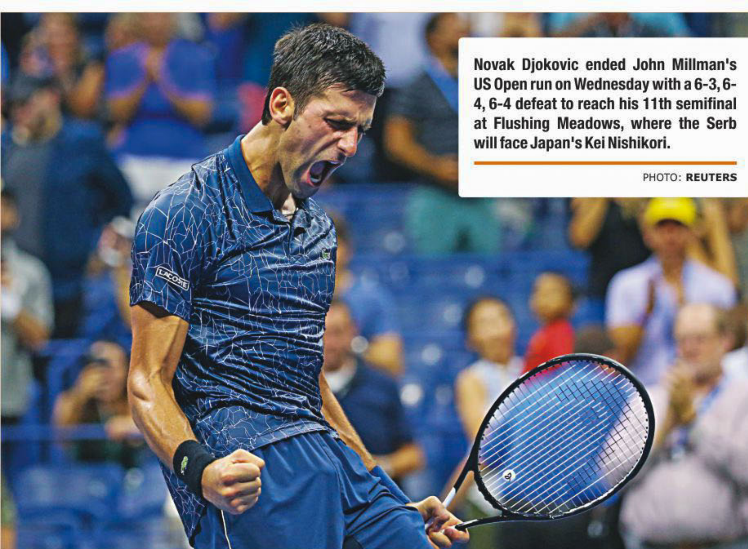
Novak Djokovic ended John Millman's US Open run on Wednesday with a 6-3, 6-4, 6-4 defeat to reach his 11th semifinal at Flushing Meadows, where the Serb will face Japan's Kei Nishikori.

"The time-off with family -- I think it is important that everybody does realise that Shakib plays a lot of cricket. In making sure he is playing at his best and freshest, we can give him opportunities to be with his family. It will make him a better player. He has done all the practice when he was younger -- it is not too necessary that he practises all the time."