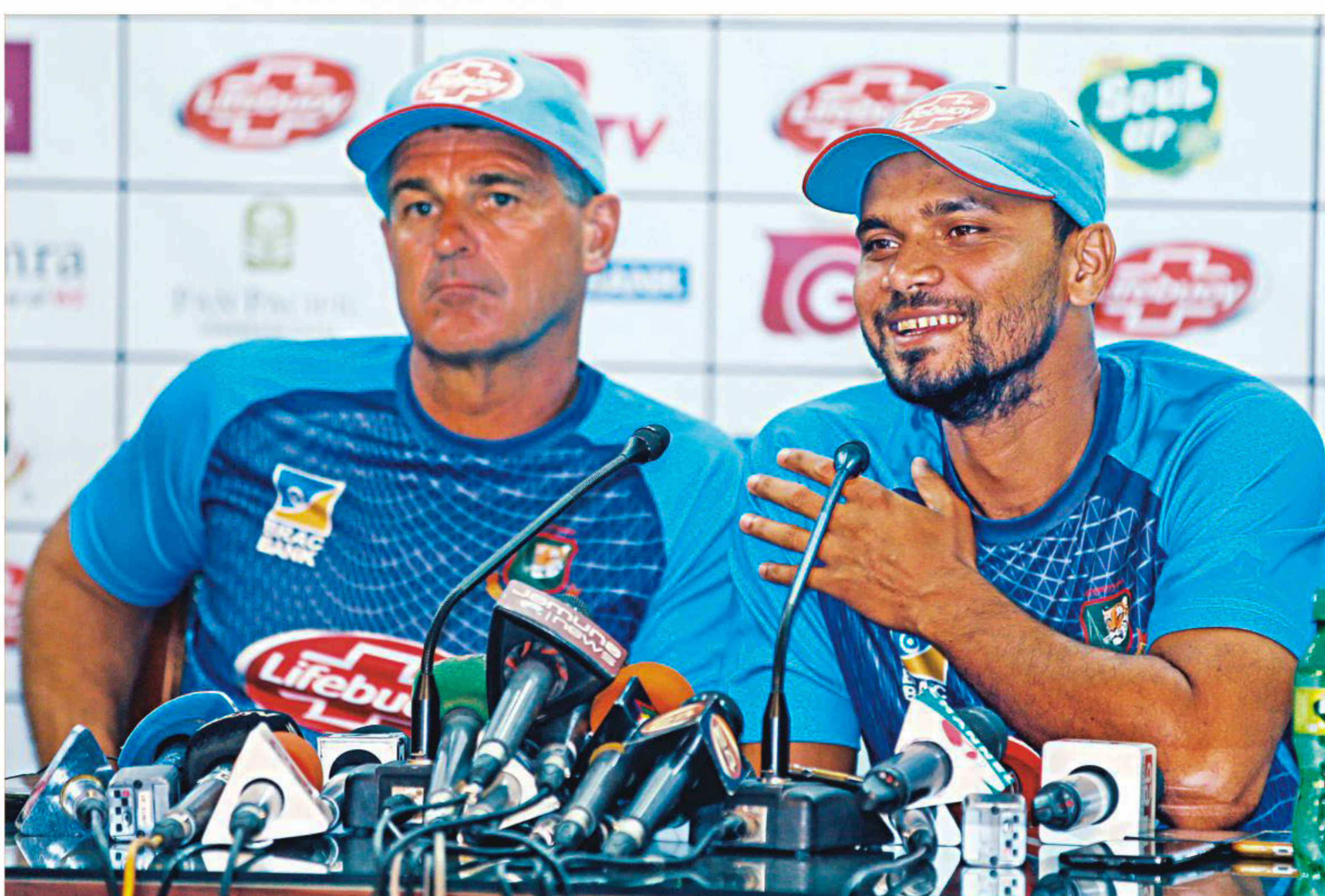
Bangladesh coach Steve Rhodes (L) and captain Mashrafe Bin Mortaza were guardedly optimistic about the team's chances in the Asia Cup during the pre-tournament press conference at the Sher-e-Bangla National Stadium in Mirpur yesterday.

All eyes, understandably, are therefore on the opener eight days from today and the team will do well to tap into their captain's laser focus.