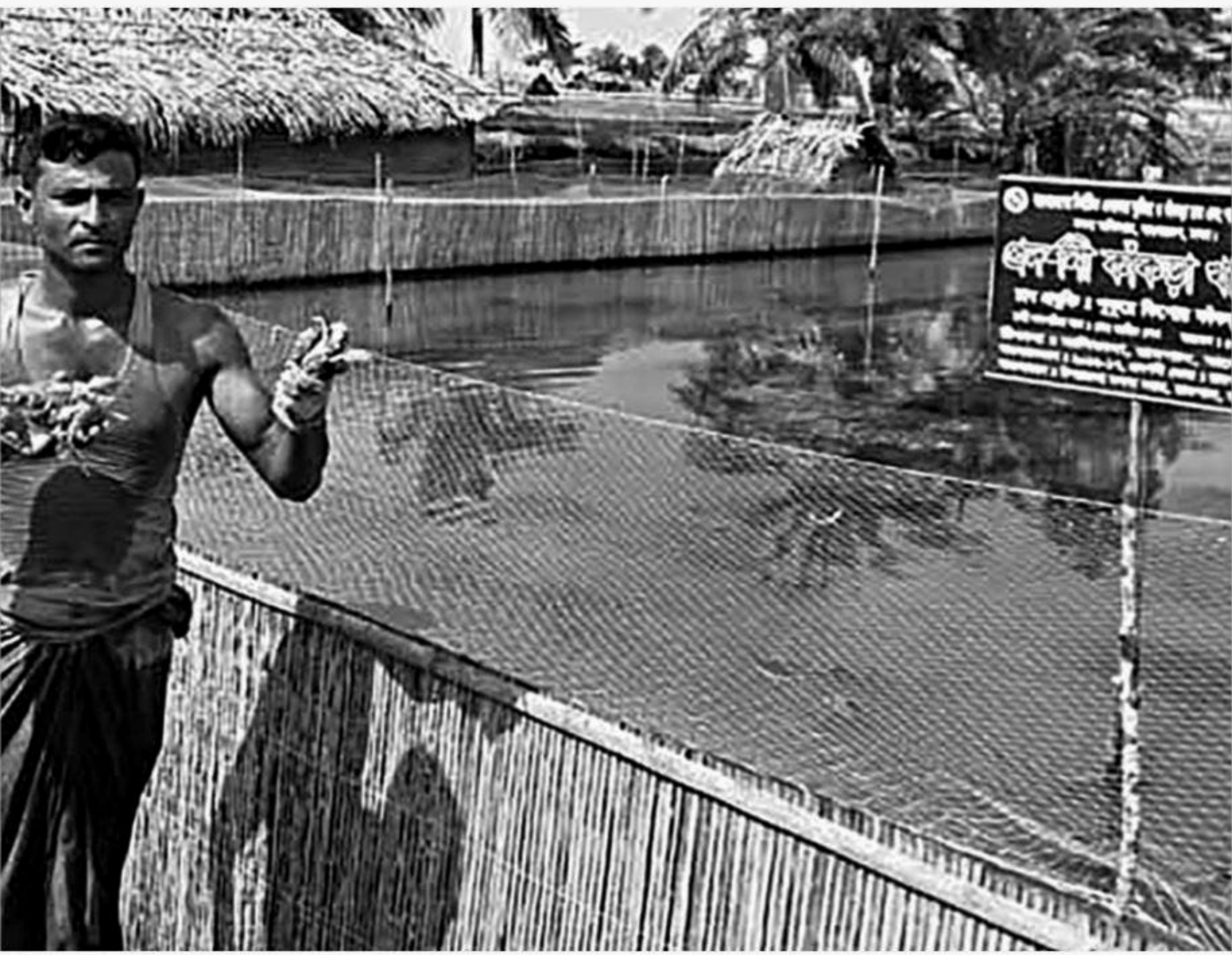
A crab enclosure in Shreefaltala village under Rampal upazila of Bagerhat. The photo was taken recently.

The mildly venomous snake breeds during March to June and lays four to ten eggs that hatch within 80 to 90 days, Tabibur Rahman said.