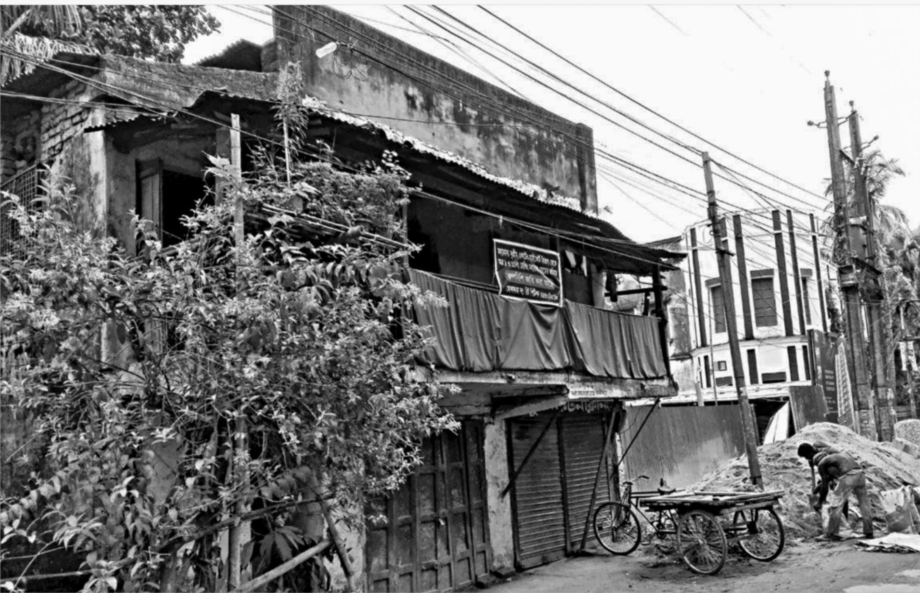
This century-old house belonging to a Hindu family on Maharaja Road in Mymensingh town faces threat of collapse as a local influential person is constructing a high-rise building, allegedly after illegally occupying the adjacent land, also belonging to the same family.