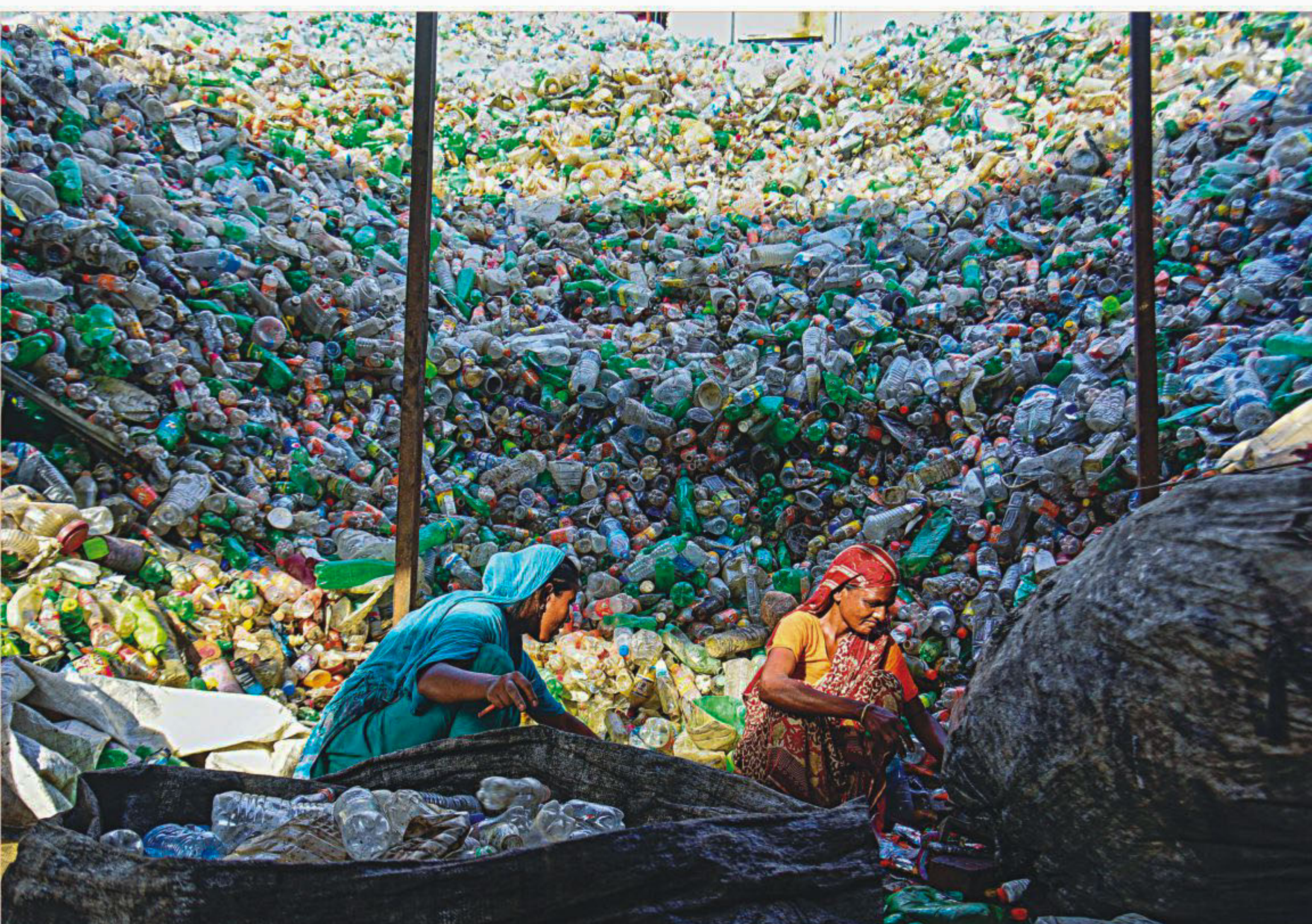
Women sorting plastic bottles for sending those to recycling facilities in Chittagong. The picture was taken recently in Bakolia area where bottles collected from across the city are gathered and transparent and coloured ones are separated.