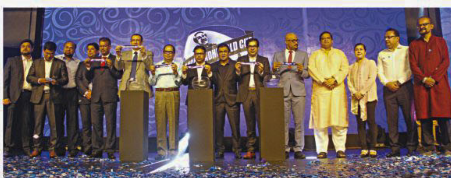
Officials pose for a photo during the draw ceremony of the Bangabandhu Gold Cup at a local hotel yesterday.

irregular fixture in the game's local governing body's calendar, will be a 12-day event starting from October 1, just half-a-month after the completion of the seven-nation SAFF Championship. The last edition of the Gold Cup was held in 2016, when Nepal U-23 defeated Bahrain