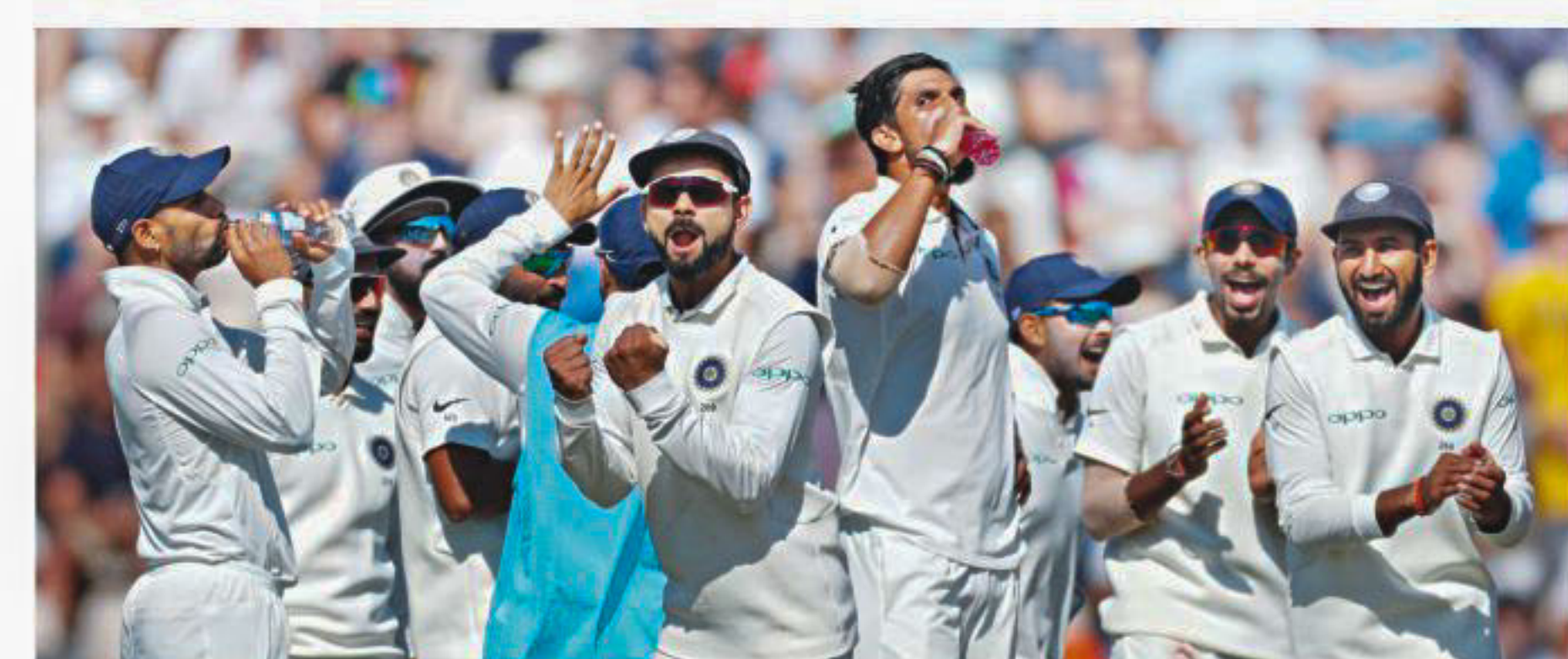
India captain Virat Kohli (C) celebrates the departure of his England counterpart Joe Root on the third day of the fourth Test in Southampton yesterday.

England: First Innings 246 all out India: First Innings 273 all out England: Second Innings 260 for 8 (Jennings 36, Root 48, Buttler 69, Curran 37 not out; Shami 2-53, Ishant 2-36)