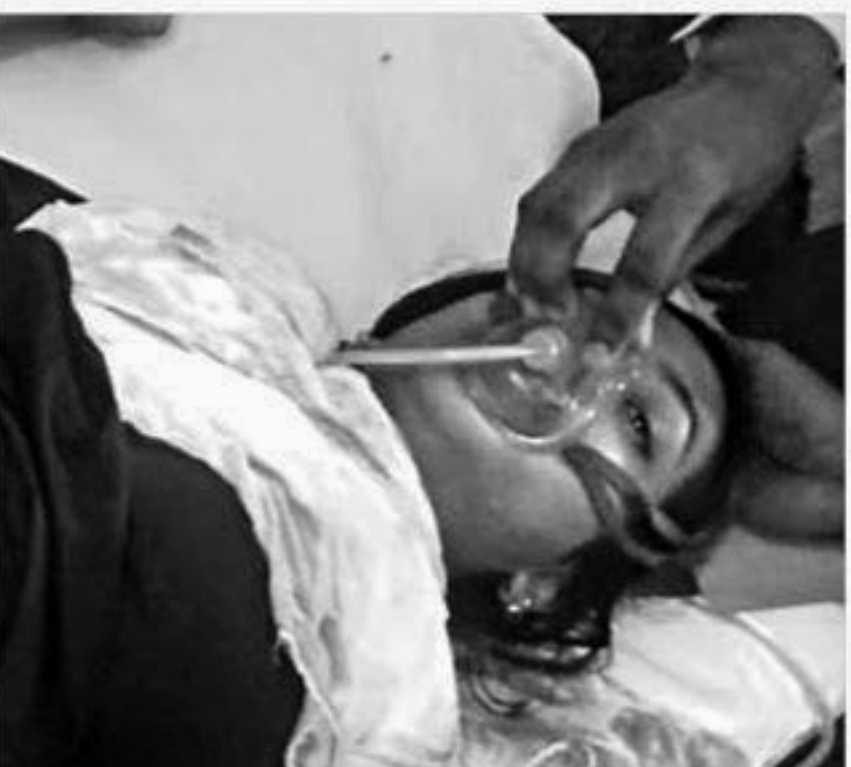
Alleged stalker, who stabbed a ninth grader, at Mohipur Police Station in Patuakhali yesterday. Right, the victim at Kalapara Upazila Health Complex.