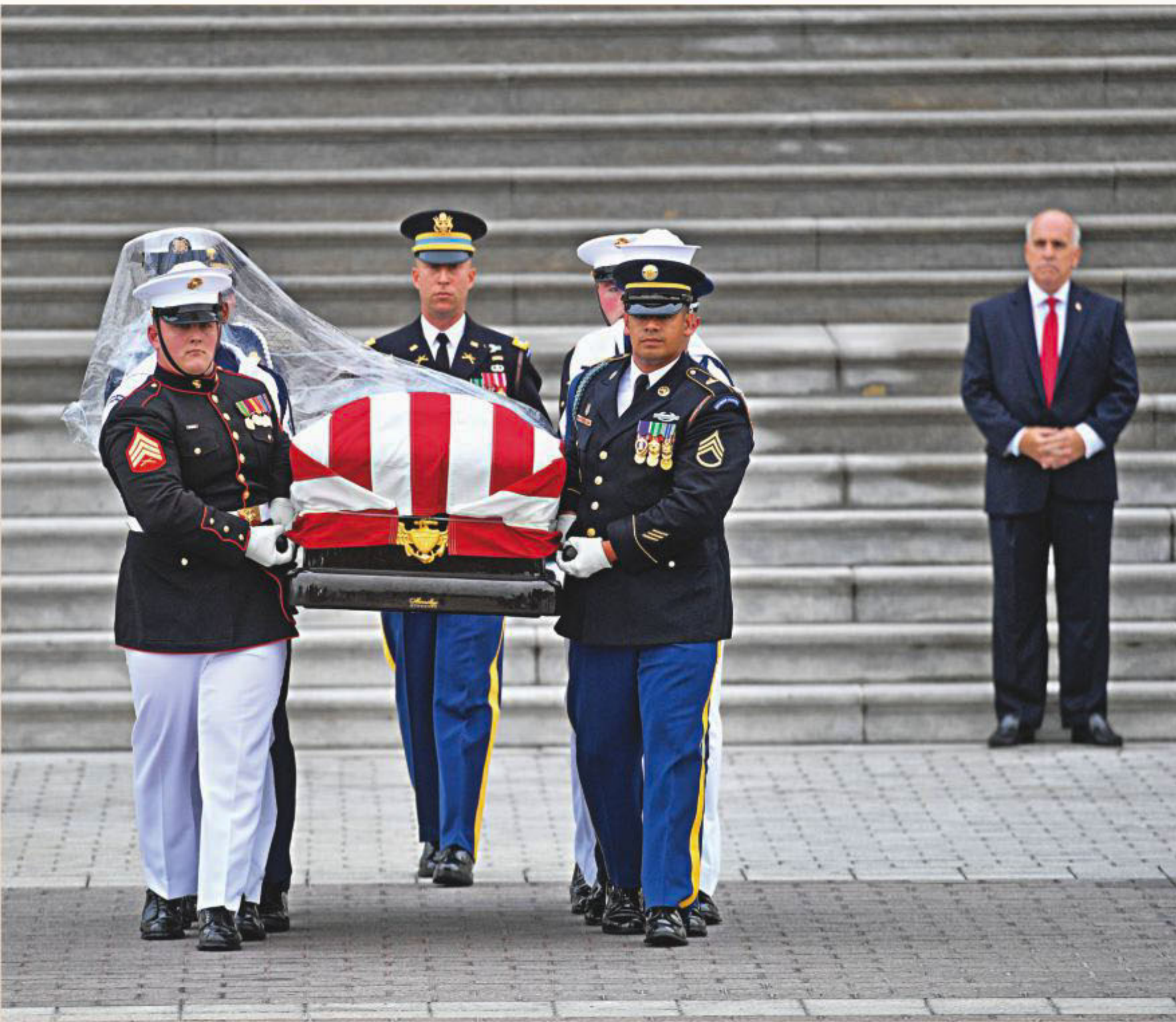
(From left, clockwise) The casket of Senator John McCain, R-Ariz., is carried down the steps of the US Capitol in Washington DC, yesterday; Former First Lady Michelle Obama, former US President Barack Obama, former Vice President Al Gore, and former US President George W Bush arrive for the Memorial Service for McCain; and Meghan McCain, daughter of US Senator John McCain, speaks during the memorial service.