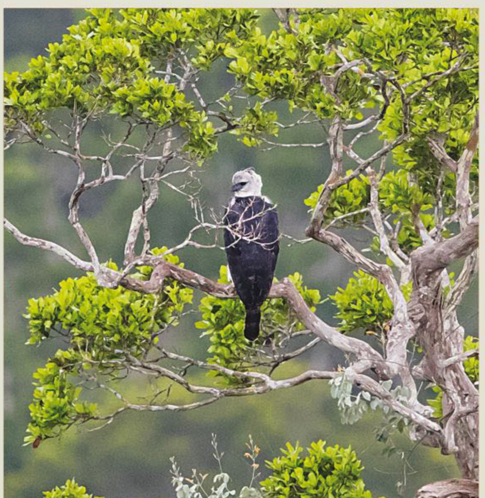
Harpy Eagle over rainforest.

At one point, I was looking east, watching a pair of White-throated Toucans about a mile away, when Gabriel suddenly grabbed my shoulder. "Harpy! Harpy! Harpy!" he whispered with great excitement. Sure enough, on top of a tree about a quarter mile behind the Toucans