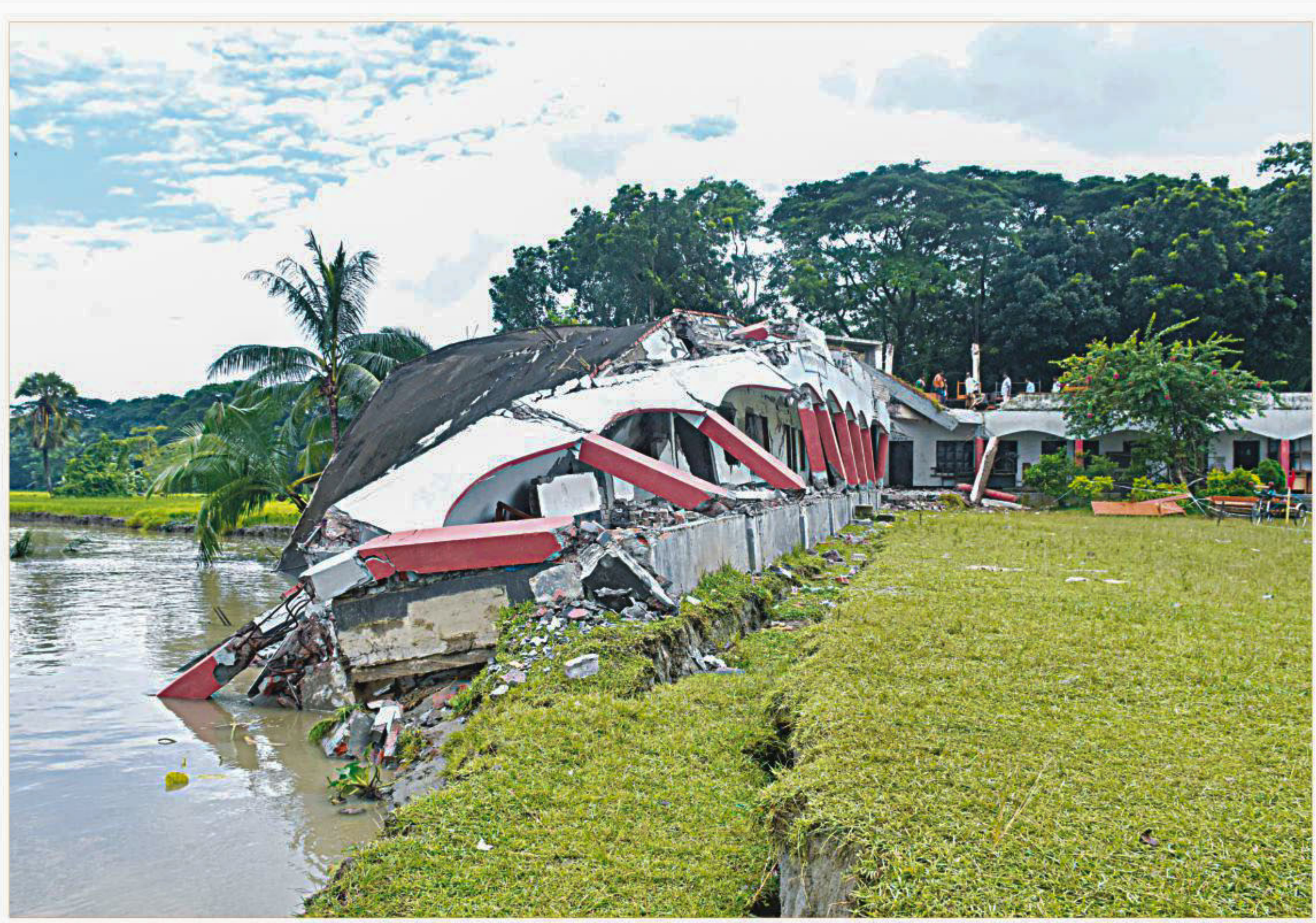
The Sugandha river devours Syed Rashida Mosharrar Academy, a high school near Bir Sreshtho Mohiuddin Jahangir Bridge in Barisal's Babuganj upazila yesterday. Erosion of the river bank has taken a serious turn in last two days as over 10 houses and a vast area of farmland have been engulfed.