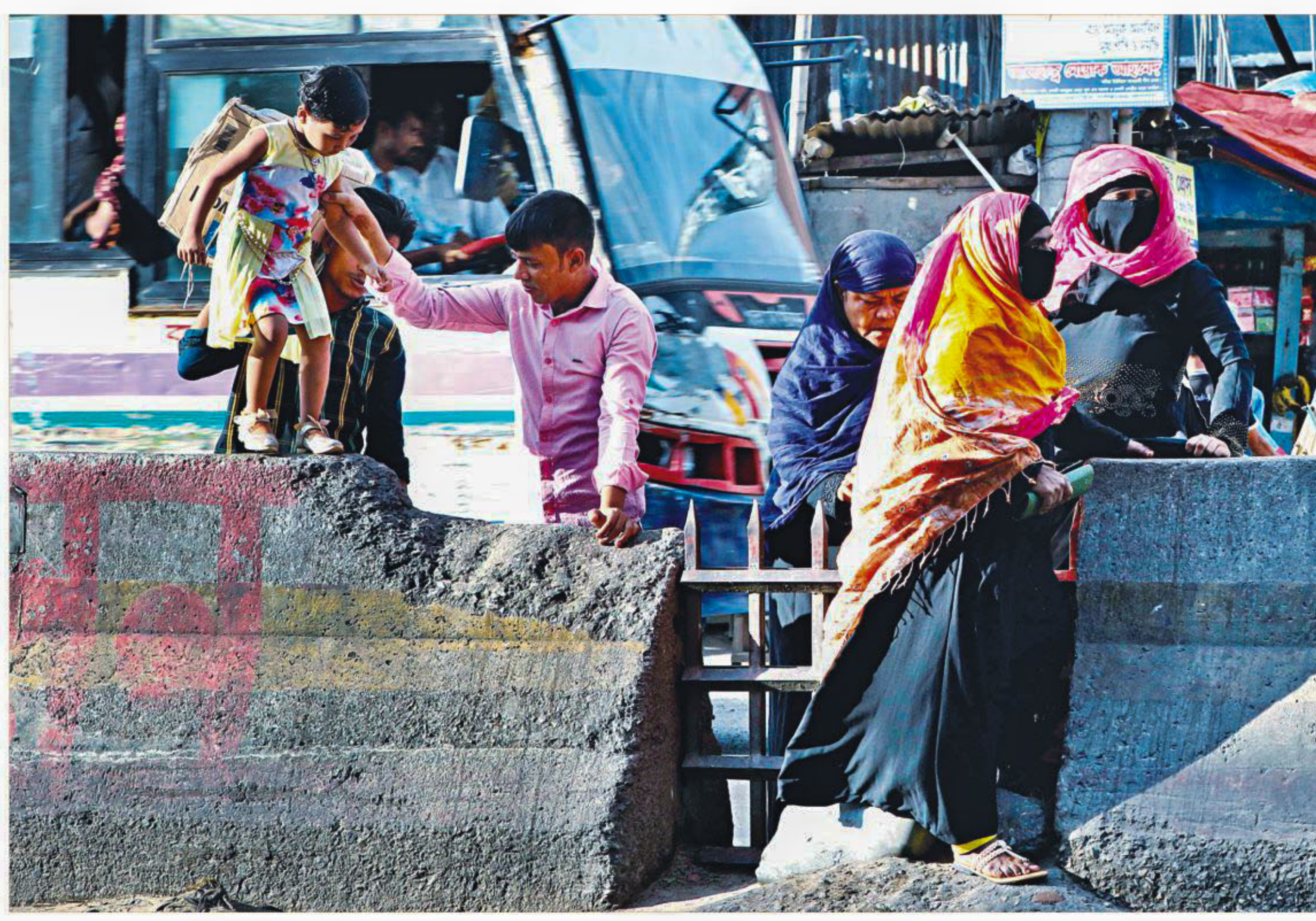
A man along with his minor daughter and other family members crosses the road at Shanir Akhra of Narayanganj through a gap in the median strip yesterday. Although a footbridge, not in picture, is just a few metres away, many pedestrians jaywalk here, putting themselves in harm's way.

custodians and the borrowers of the institution. India's Banking Regulation Act, 1949, clearly states that shareholders and directors of banks have two completely different roles, and the law prevents them from mixing the roles. The shareholders own the shares of a company while the directors, who would predominantly be professionals, manage the institution. A director doesn't need to be a shareholder and a shareholder has no right to be a director, it mentions. This reasoning is the basis of banking acts in the developed world as well. But Bangladesh is an exception to this, SEE PAGE 2 COL 2