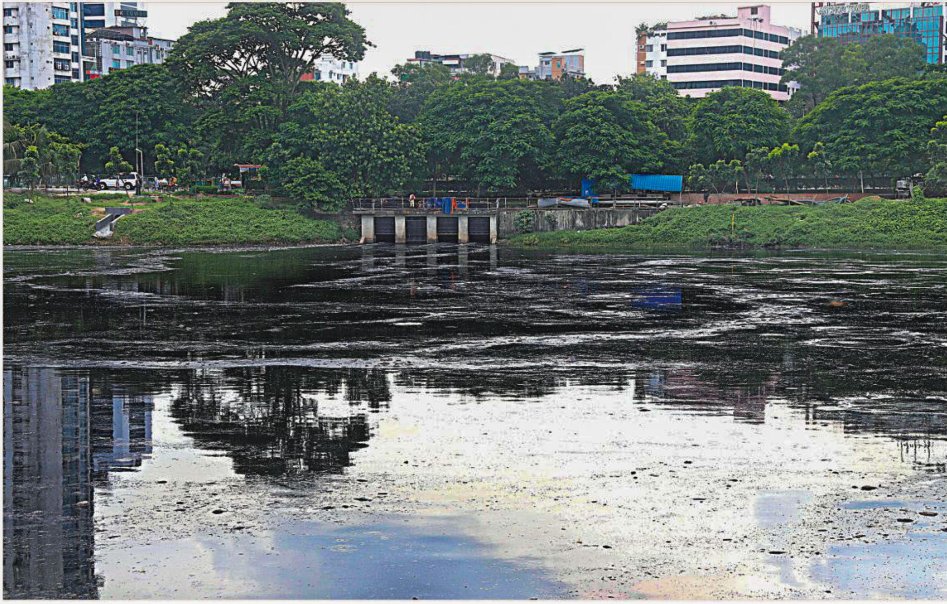
REPULSIVE... In the overcrowded Dhaka, the Hatirheel project was supposed to be a respite for city dwellers. But in some cases, it is doing quite the opposite. Whenever passing by the lake, a pedestrian or commuter is bound to catch the stench it gives off near Sonargaon hotel because several drainage pipes empty into this lake. Making matters worse is the recent waste of sacrificed animals getting into the water. The photo was taken yesterday.