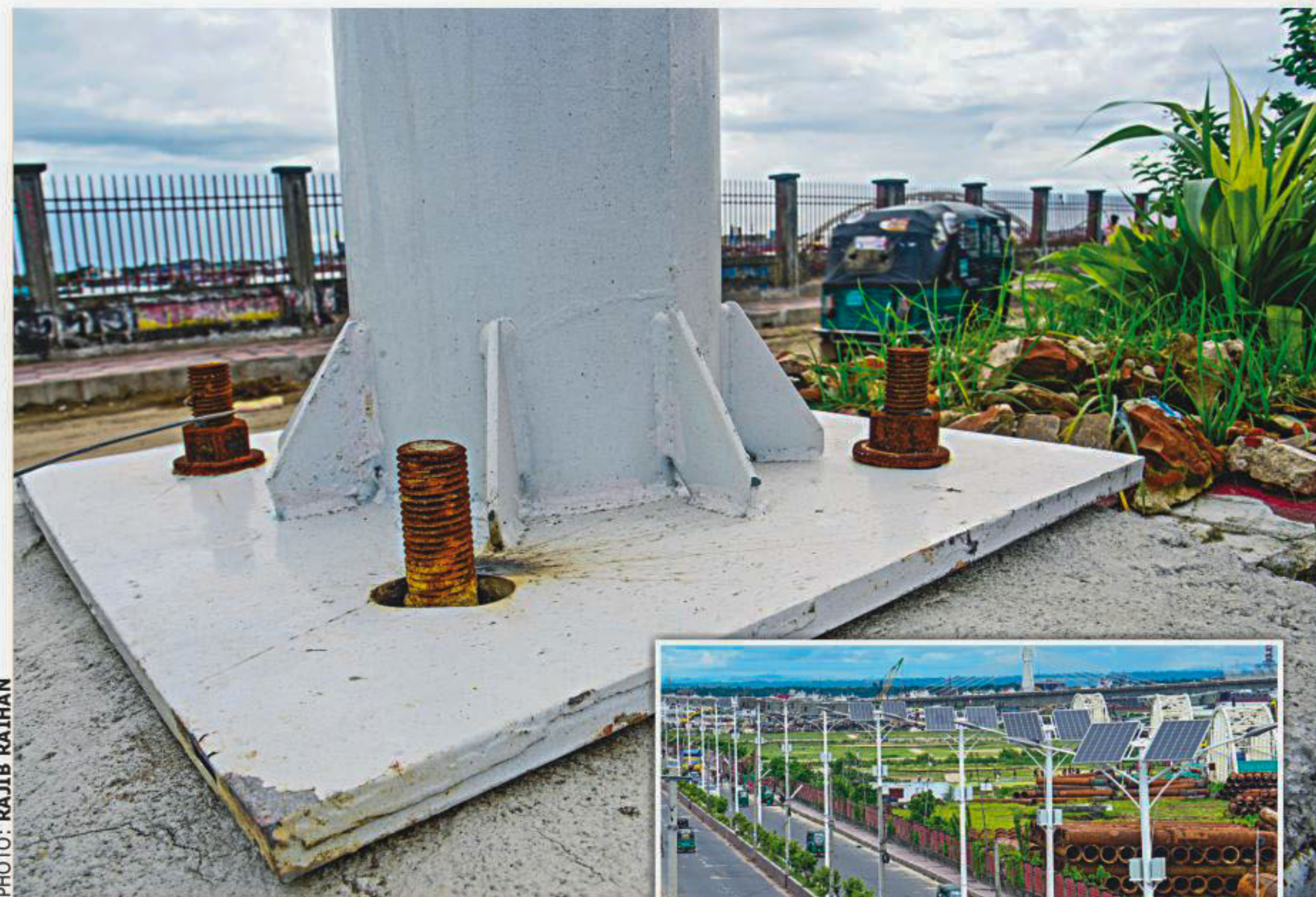
Chittagong City Corporation recently installed lamp-posts with solar panels for street lighting on the Marine Drive road, but some pillars have become shaky as unidentified people stole the bolts from the nuts on their base. The photos were taken yesterday.

Quoting the neighbours, sub-inspector Nasiruddin Hawlader of Demra police station said although the women were wearing burqa, their faces were visible.