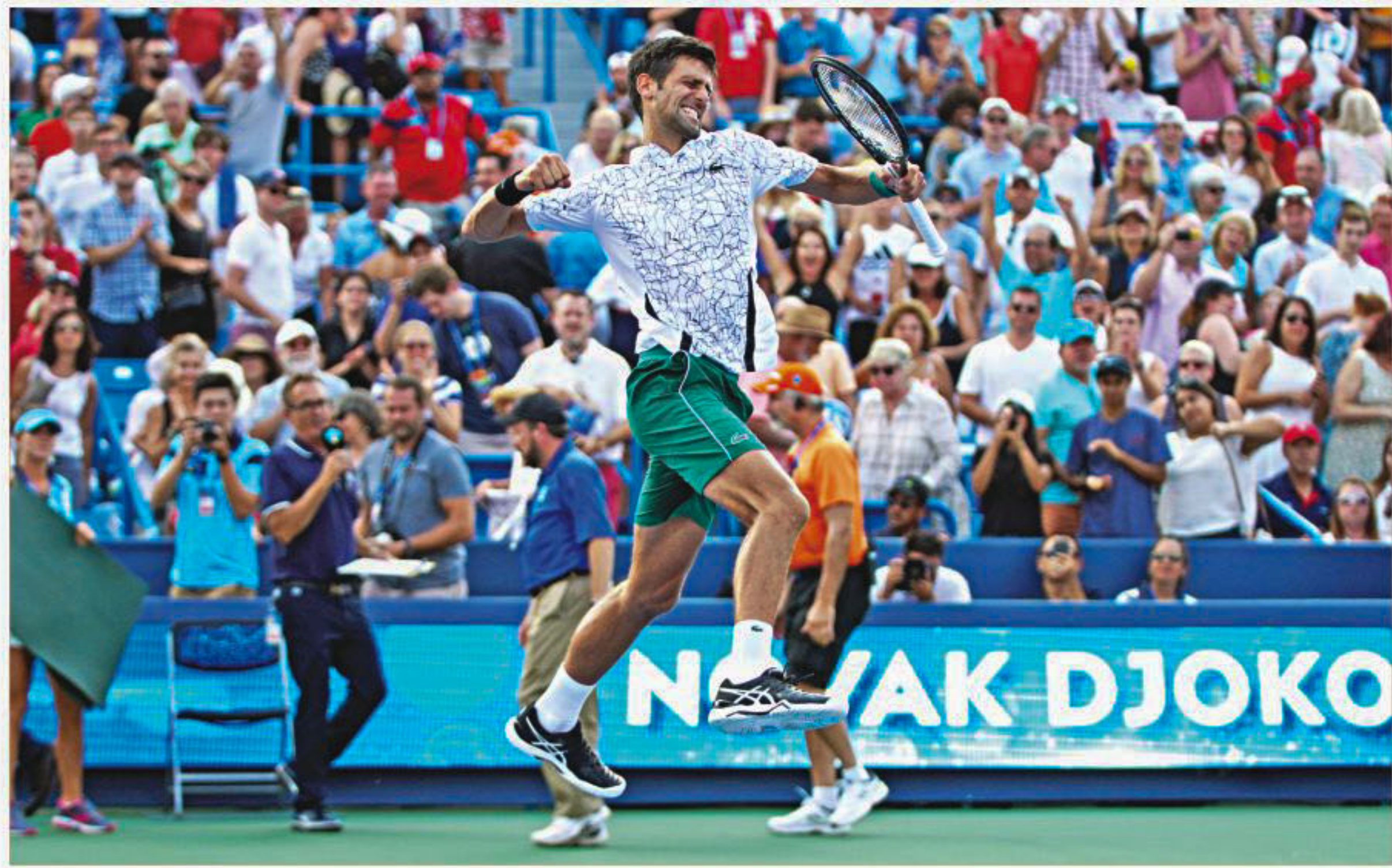
Novak Djokovic further cemented his status as one of the greatest players to pick up a racket by defeating fellow all-timer Roger Federer in the Cincinnati Masters final on Sunday and becoming the first man to win all nine Masters 1000 titles.

Djokovic broke again to lead 4-3, and after Federer held to close the gap to 4-5 Djokovic ended the afternoon in the next game on his first match point.