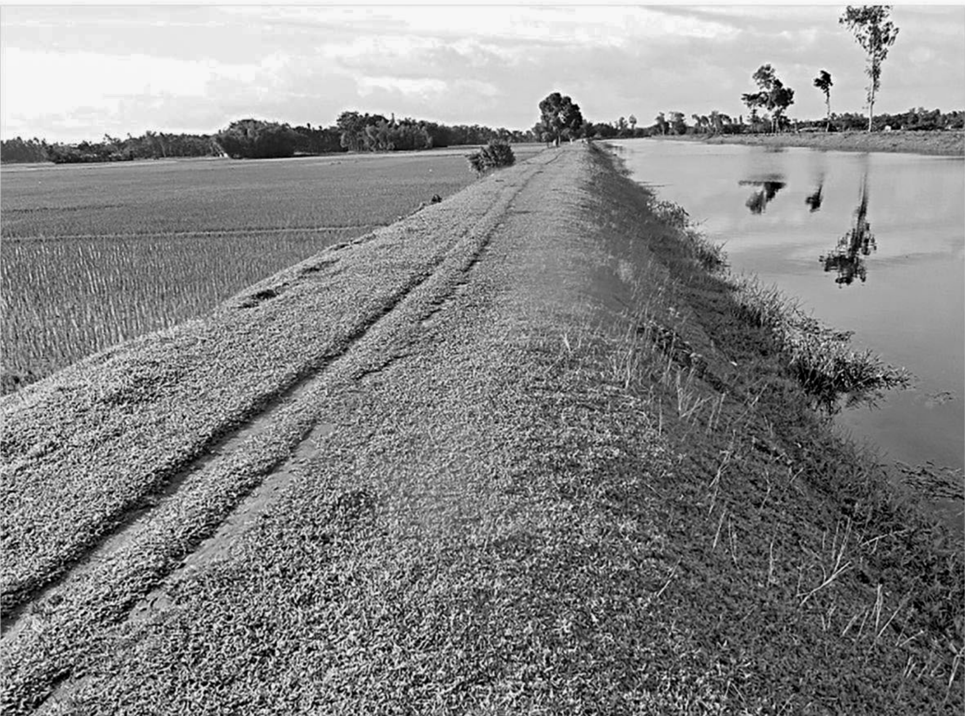
A vast tract of green Aman fields irrigated under Teesta Irrigation Project beside Dinajpur branch canal at Chanderhat village in Sadar upazila of Nilphamari.