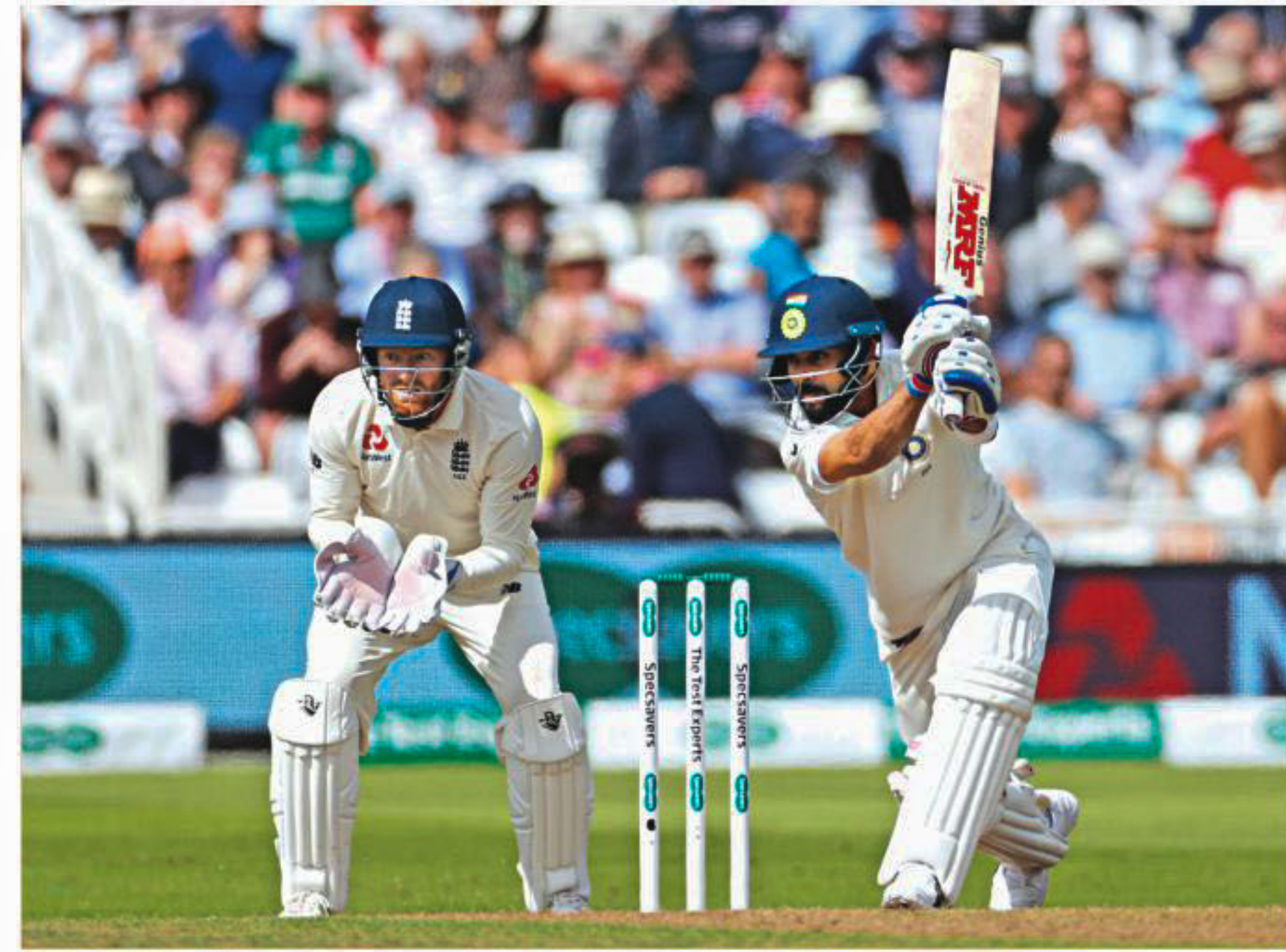
India captain Virat Kohli plays a cover drive during the first day of the third Test against England at Trent Bridge yesterday. Kohli played a fine knock of 97 missing out on a deserved century by 3 runs.