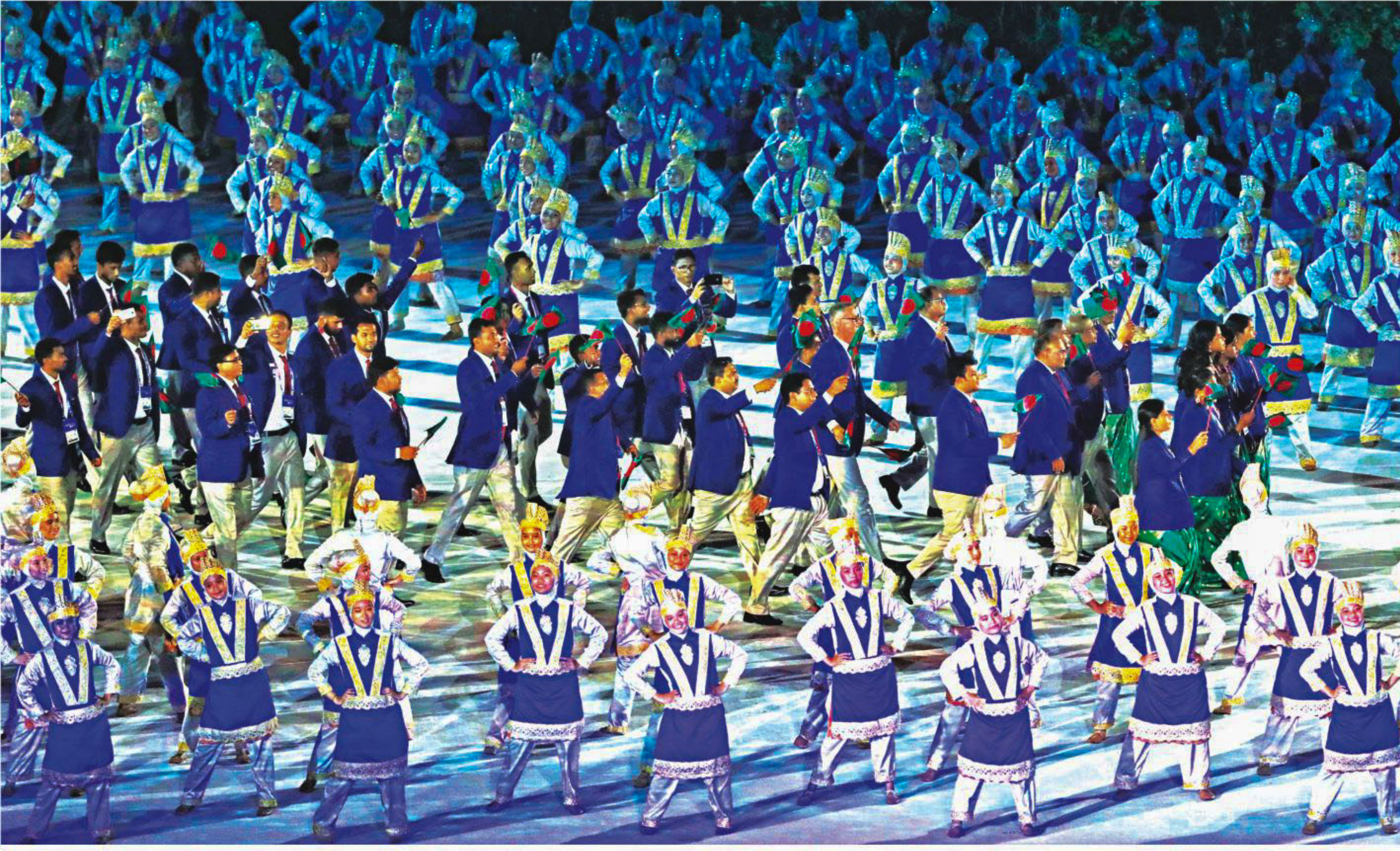
The Bangladesh athletes attend a marchpast session surrounded by the colours and festivity of the opening ceremony of the Asian Games at the Gelora Bung Karno Stadium in Jakarta yesterday.