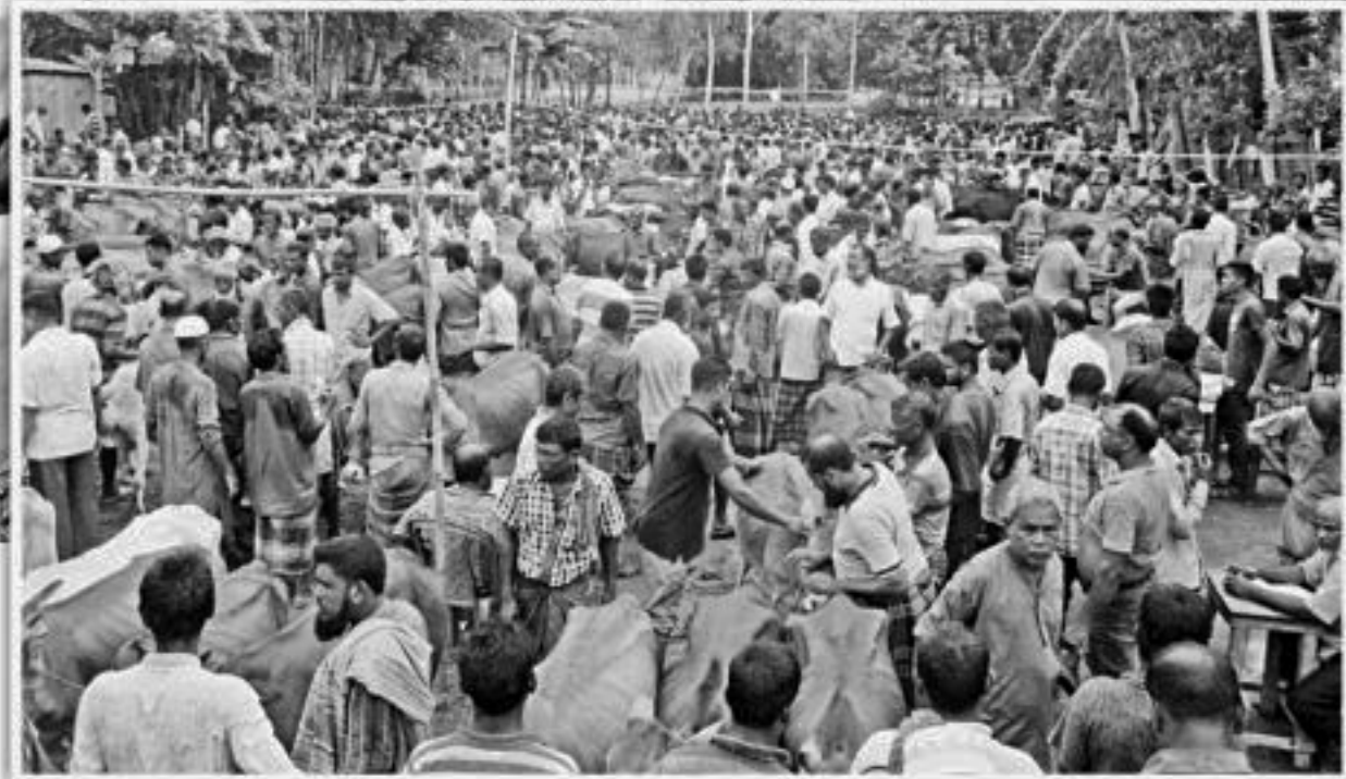
A cattle market at Tartipur in Chapainawabganj is filling up as Eid-ul-Azha draws near. Inset: Traders and buyers throng Dariyapur cattle market in Gaibandha.