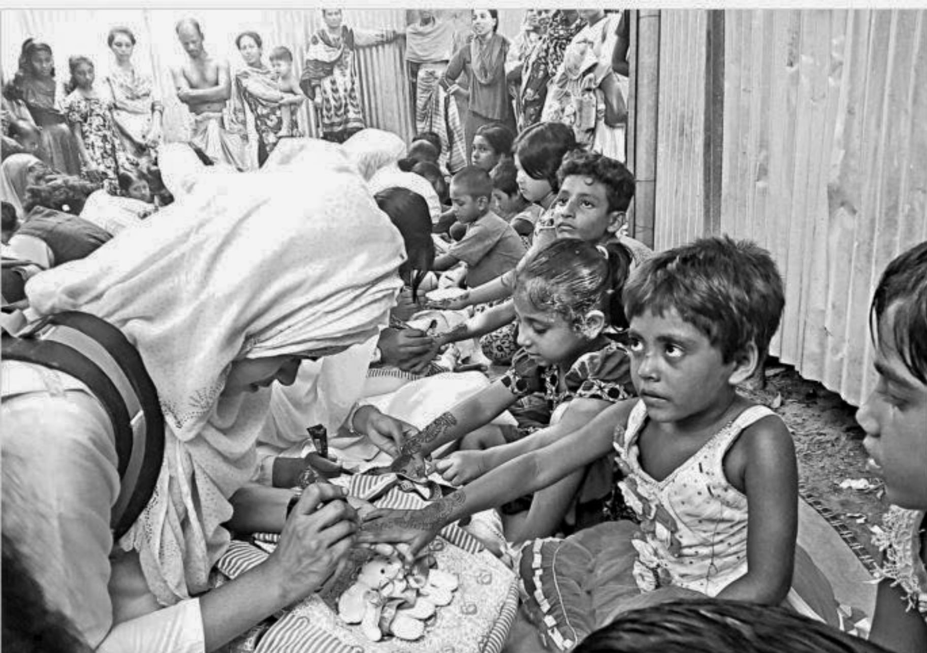
Ahead of Eid, children of Manikganj under the banner of Disheri arrange a mehed festival for the children of Bewtha slum in the town yesterday.