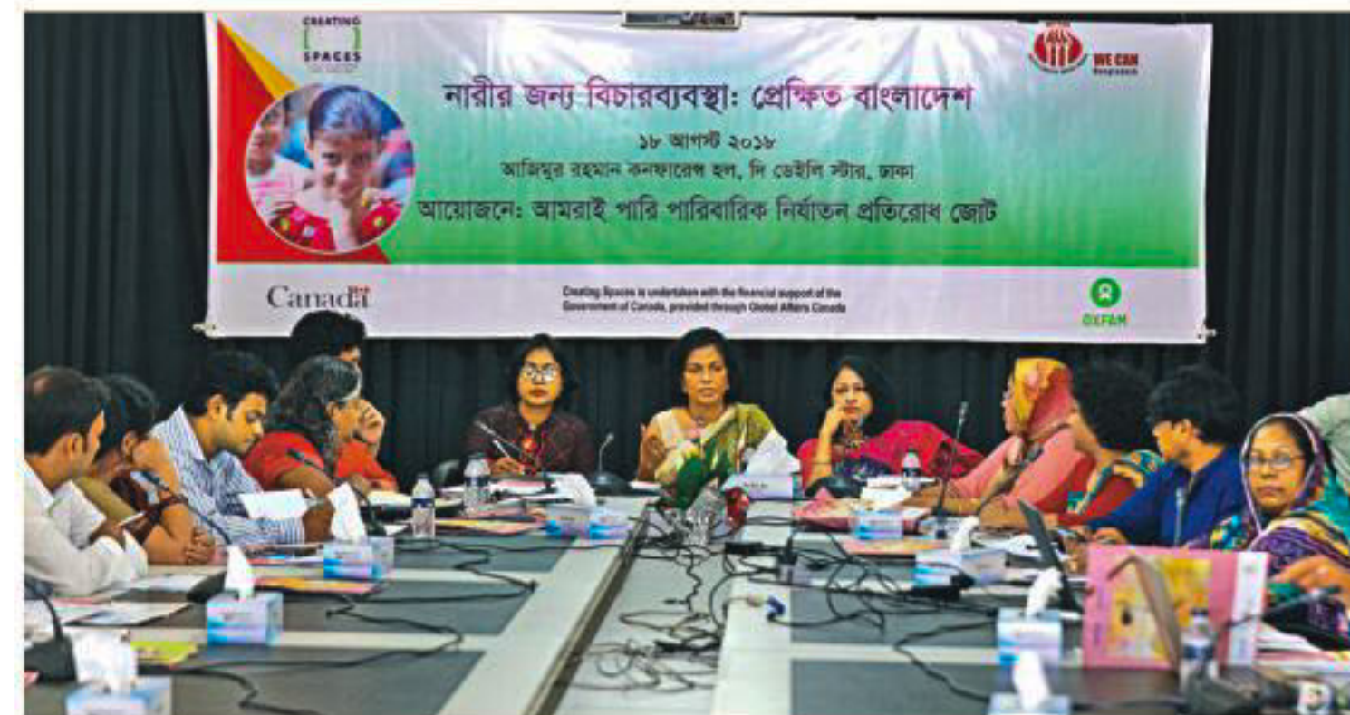
Discussions at the roundtable at The Daily Star Centre yesterday.