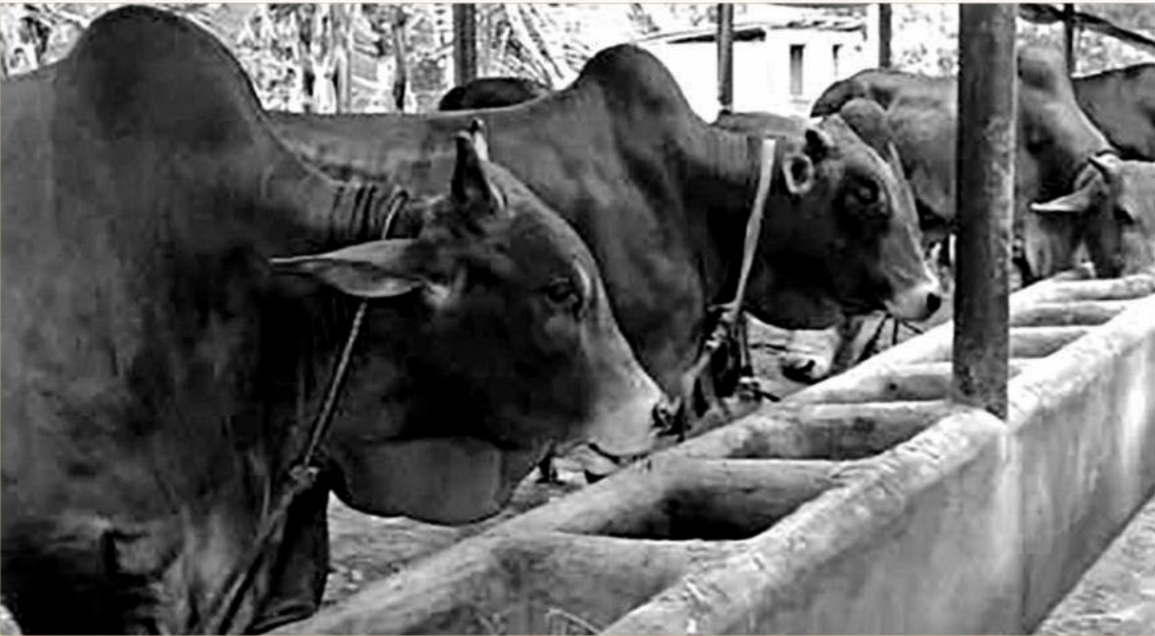
Brahman cows at a farm in Mollahat upazila of Bagerhat.