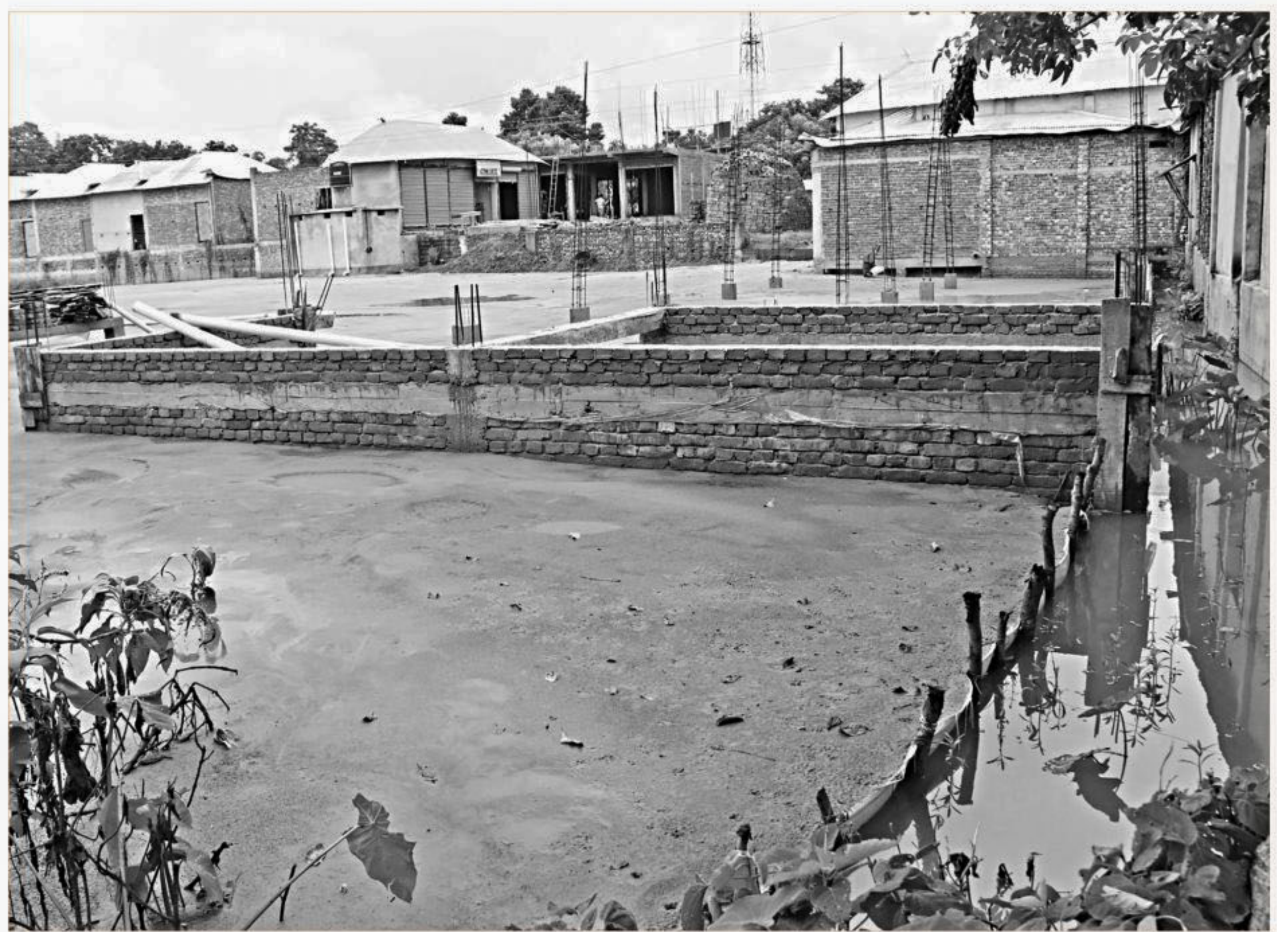
Some ruling party men continue construction of a market on this leased railway land near Satair Railway Station in Faridpur's Boalmari upazila. The photo was taken on August 3.

Younus Ali, divisional estate officer of BR in Pakshey, said, "There is no provision of changing the status of any railway land."