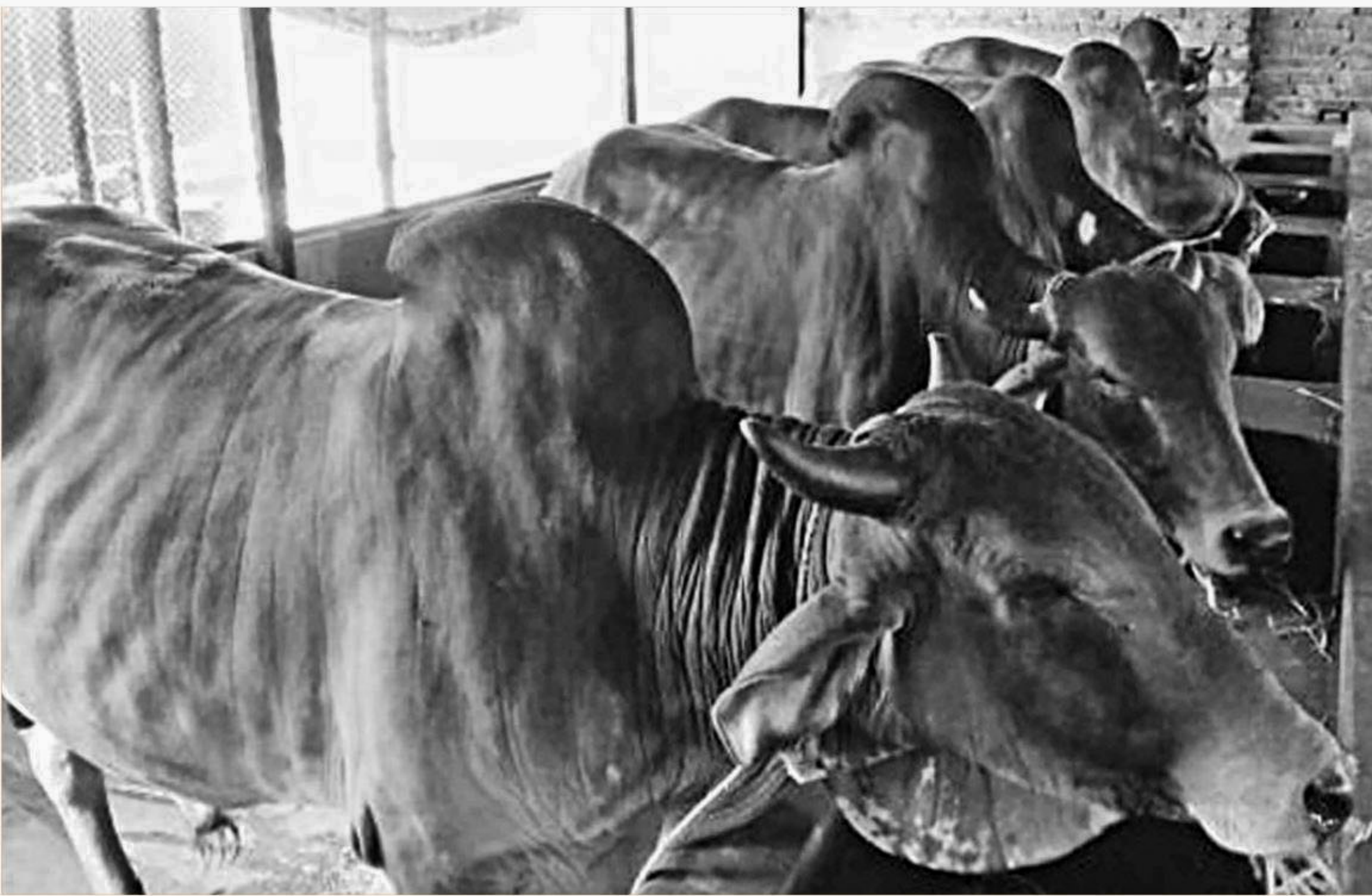
Cows reared at a farm in Tapat area of Rangpur city are ready for Eid-ul-Azha. The photo was taken recently.