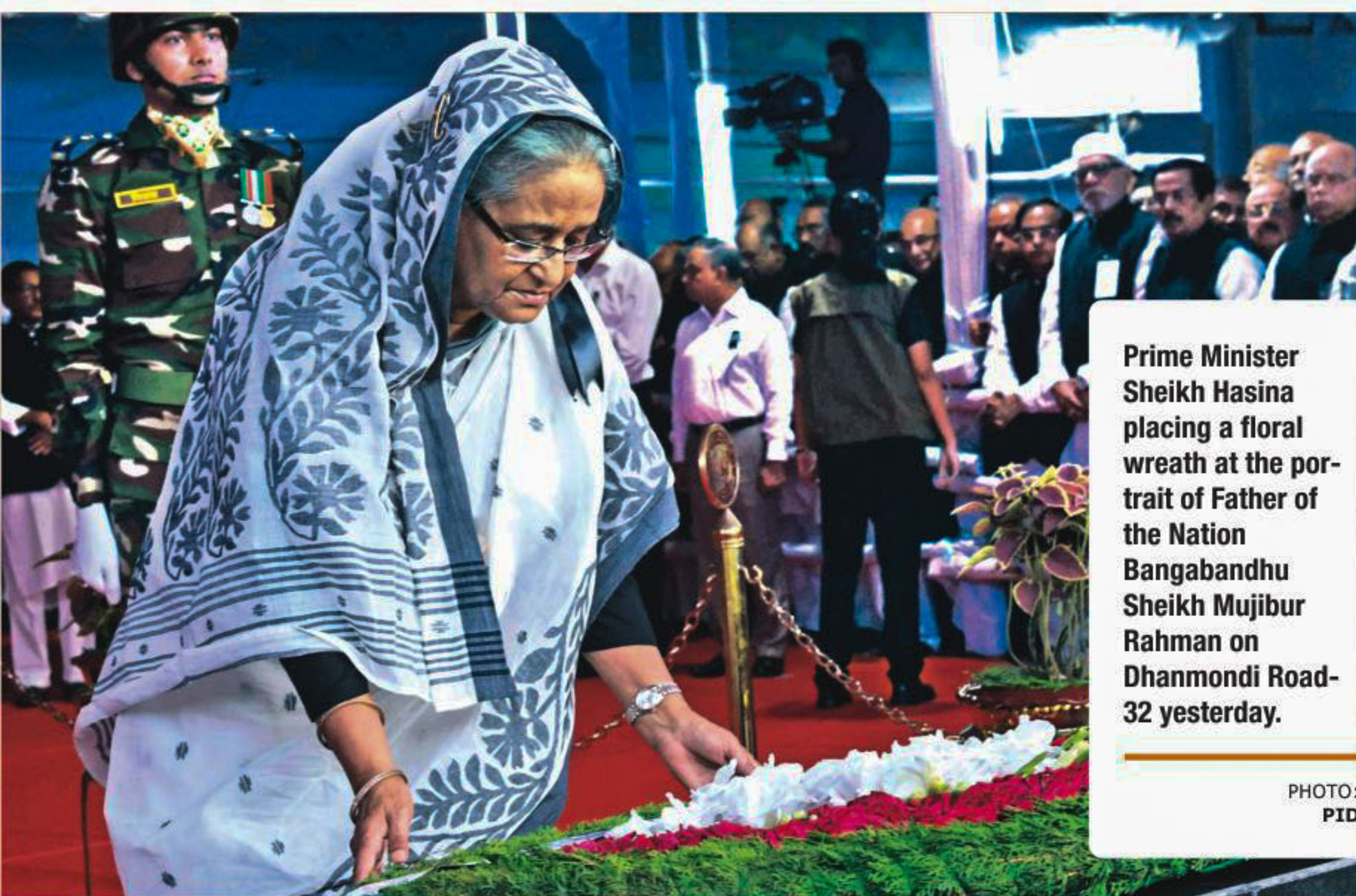
Prime Minister Sheikh Hasina placing a floral wreath at the portrait of Father of the Nation Bangabandhu Sheikh Mujibur Rahman on Dhanmondi Road-32 yesterday.