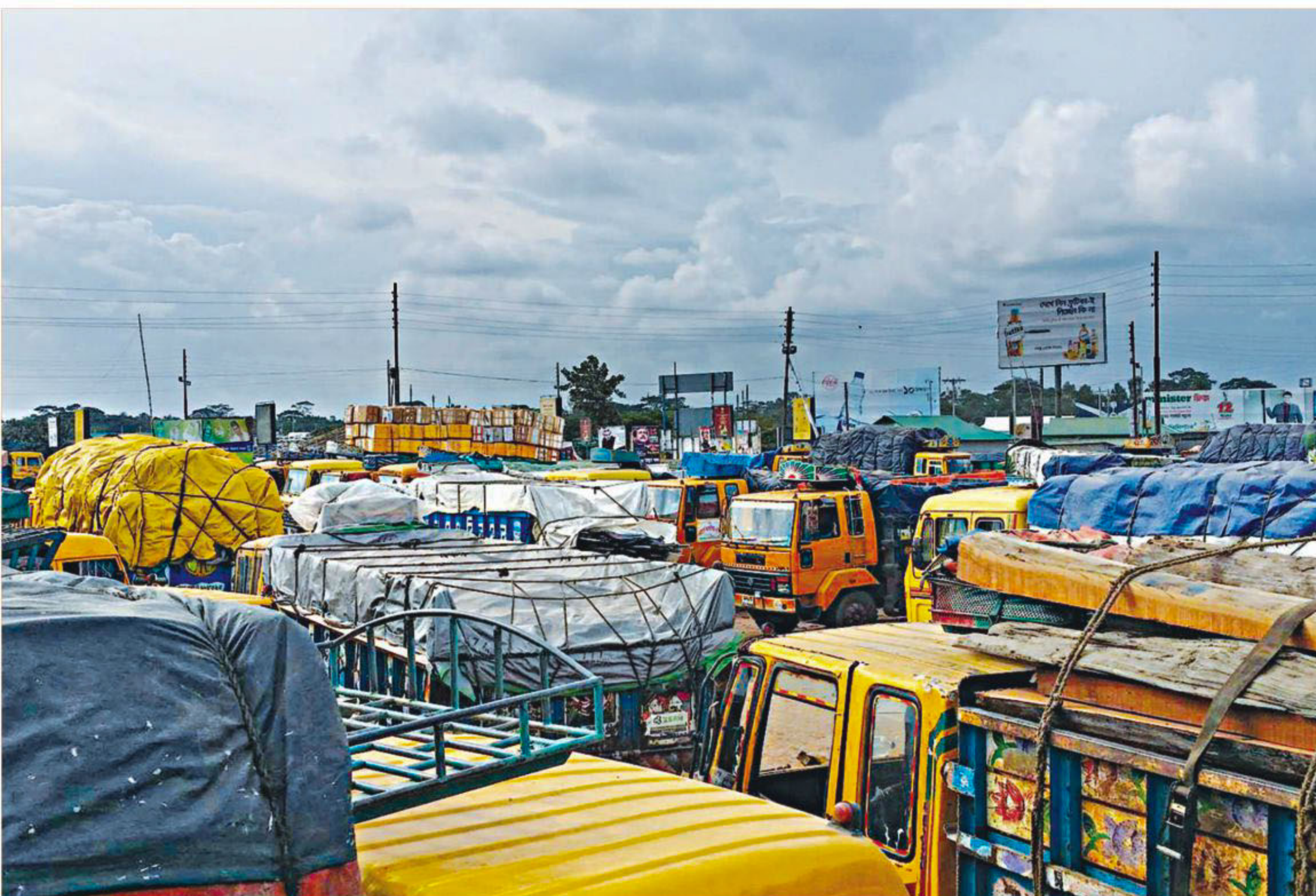
Loaded trucks parked near Shimulia Ferry Ghat in Munshiganj's Louhajang upazila yesterday. Several hundred heavy vehicles remained stranded there as the ferry service was disrupted on Shimulia-Kathalbari route for the third straight day yesterday due to poor navigability in a stretch of the Padma.