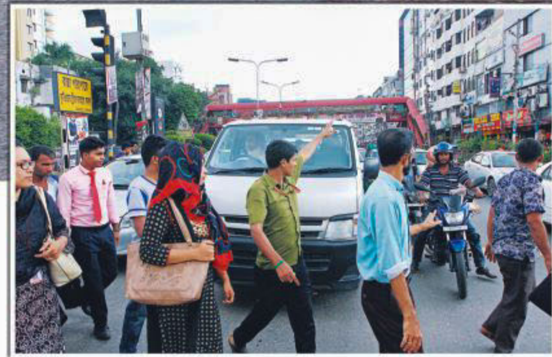
A youth runs across the road to get on a moving bus dodging traffic. Inset, a man, among several jaywalkers, raises his hand to signal a vehicle to stop to cross the Airport Road, instead of using the footbridge just a few feet away. Violation of traffic rules continues amid the ongoing Traffic Week, which was launched to strictly enforce traffic laws.