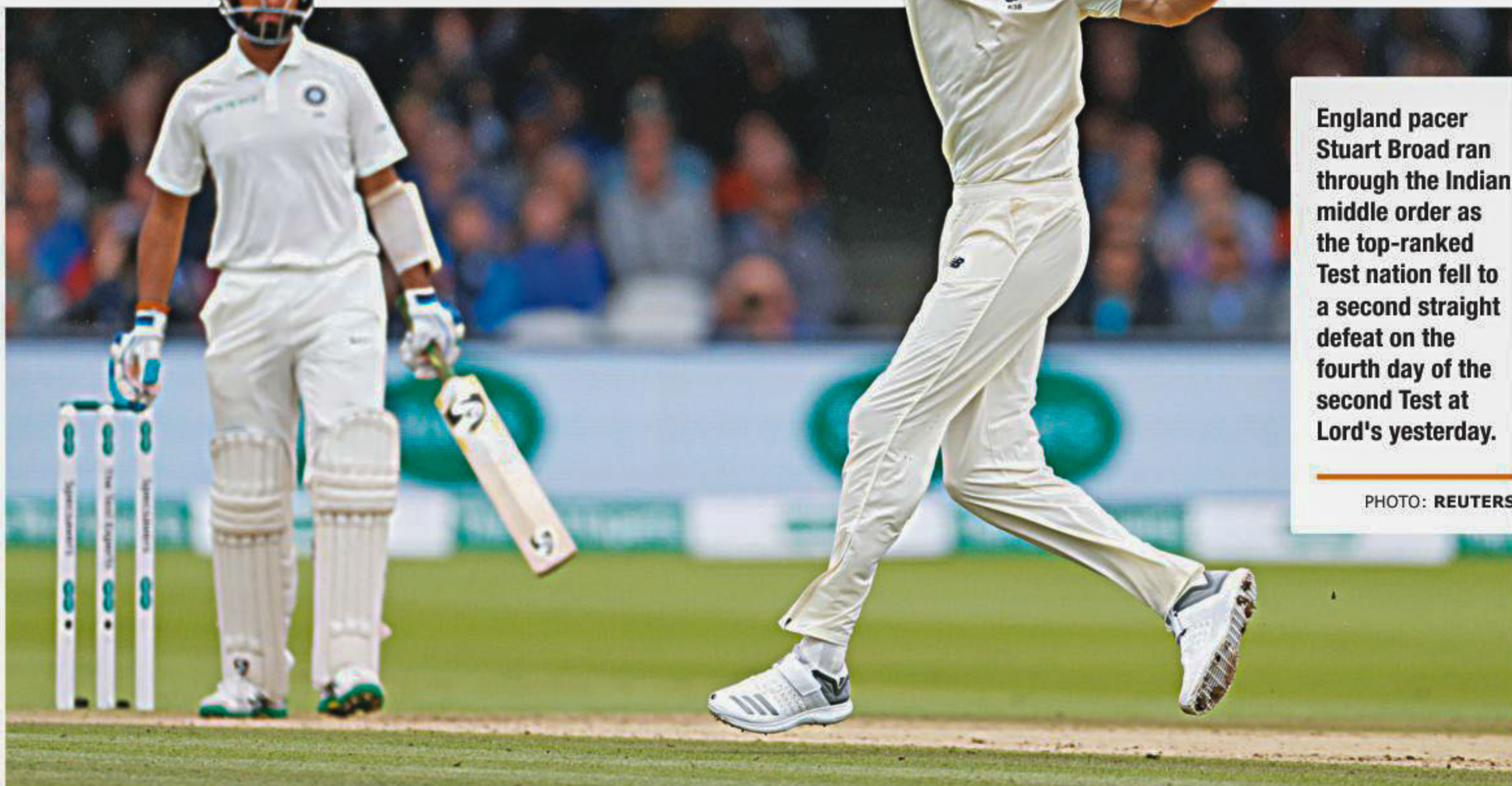
England pacer Stuart Broad ran through the Indian middle order as the top-ranked Test nation fell to a second straight defeat on the fourth day of the second Test at Lord's yesterday.