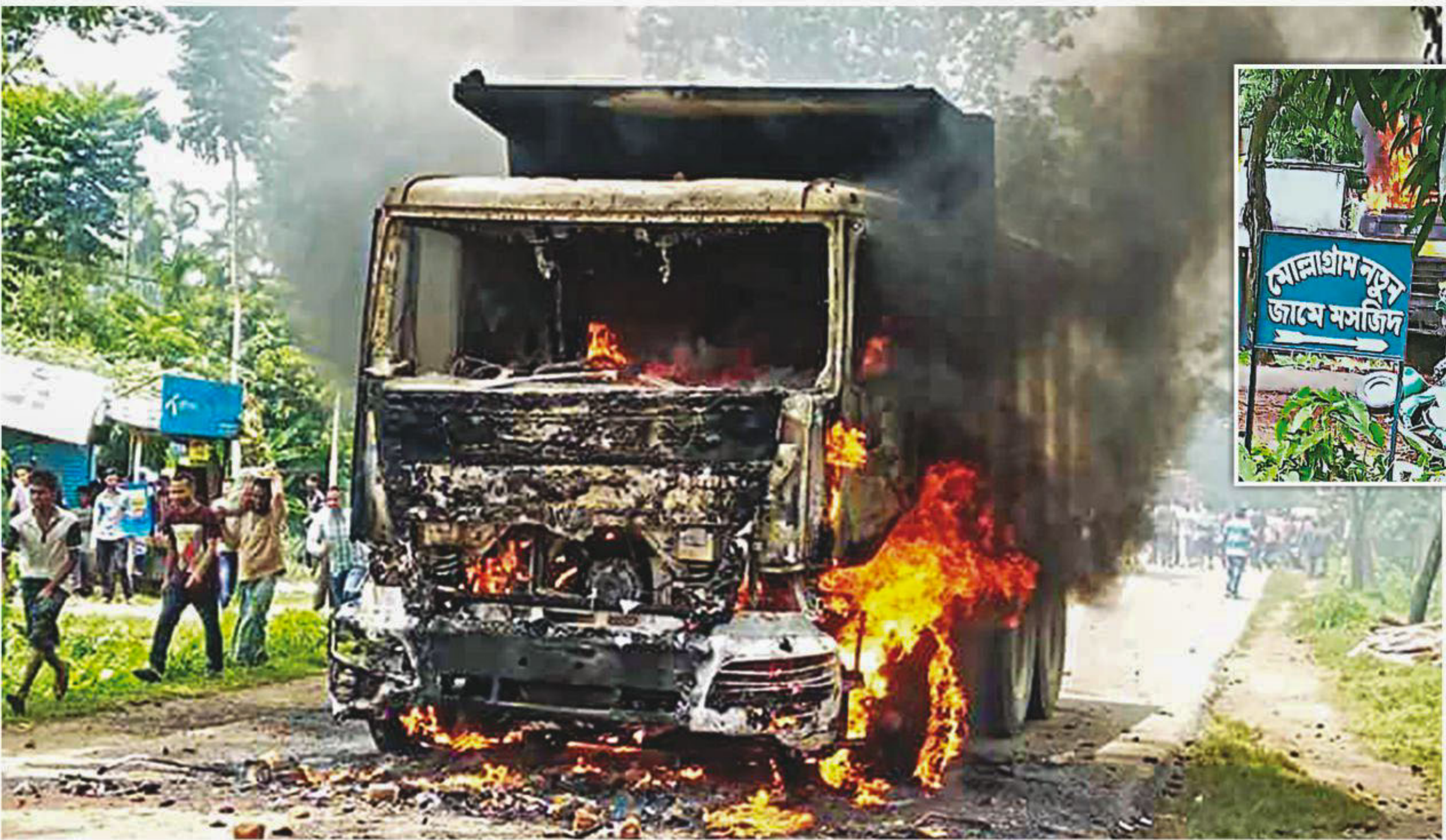
Locals torch a tipper lorry at Hetimganj on Sylhet-Zakiganj Road yesterday after the vehicle collided with an autorickshaw, inset, killing two people on the spot.

The OC said the truck driver fled the spot.