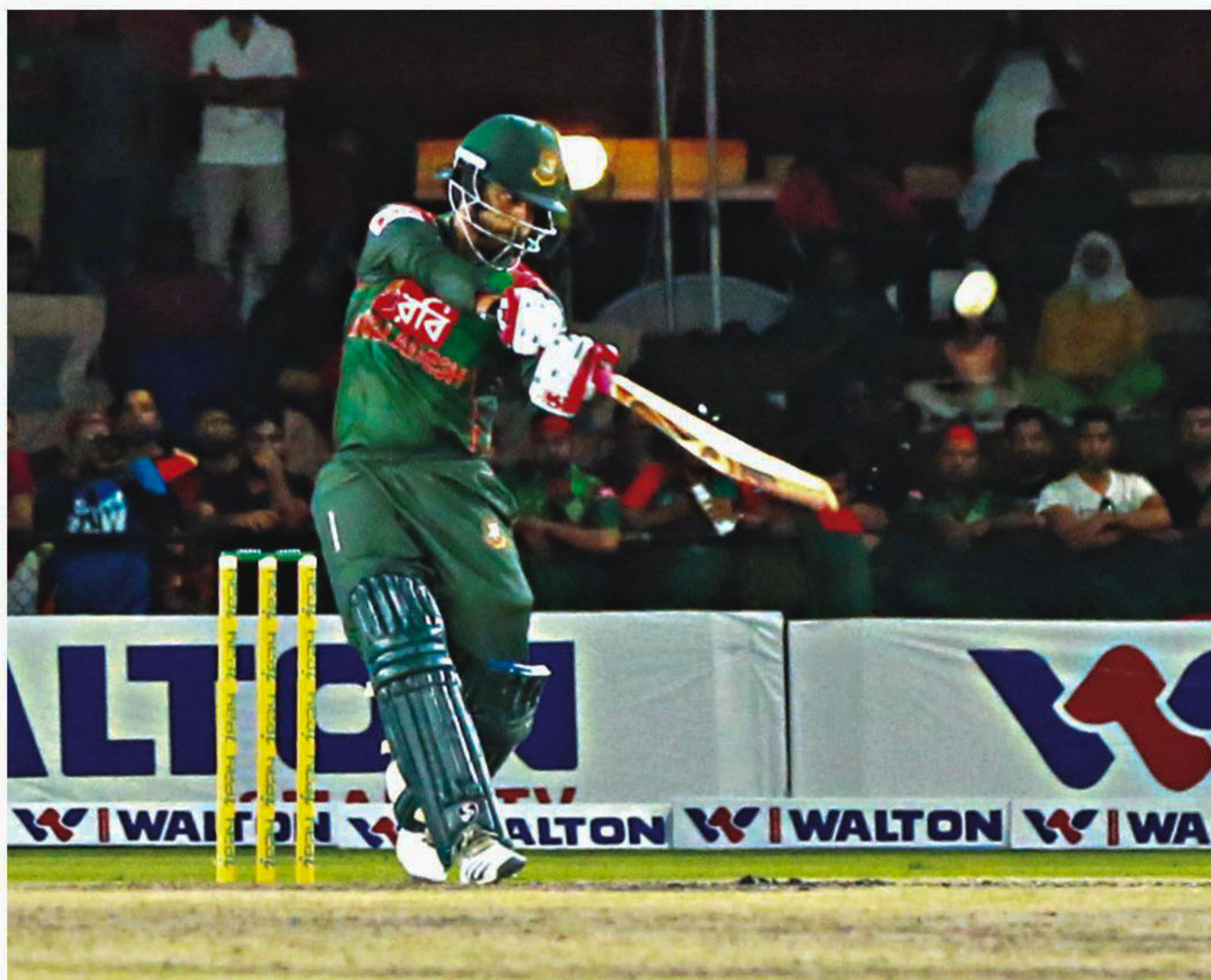
Bangladesh opener Tamim Iqbal not only reached another level of consistency during the limited-overs leg of the tour of West Indies and USA, but also set a great example of learning from mistakes.

Of course, there are improvements to be made in Test cricket, but given his record of self-improvement the odds are in favour of Tamim not just being the best batsman in Bangladesh, but in the top few in world cricket.