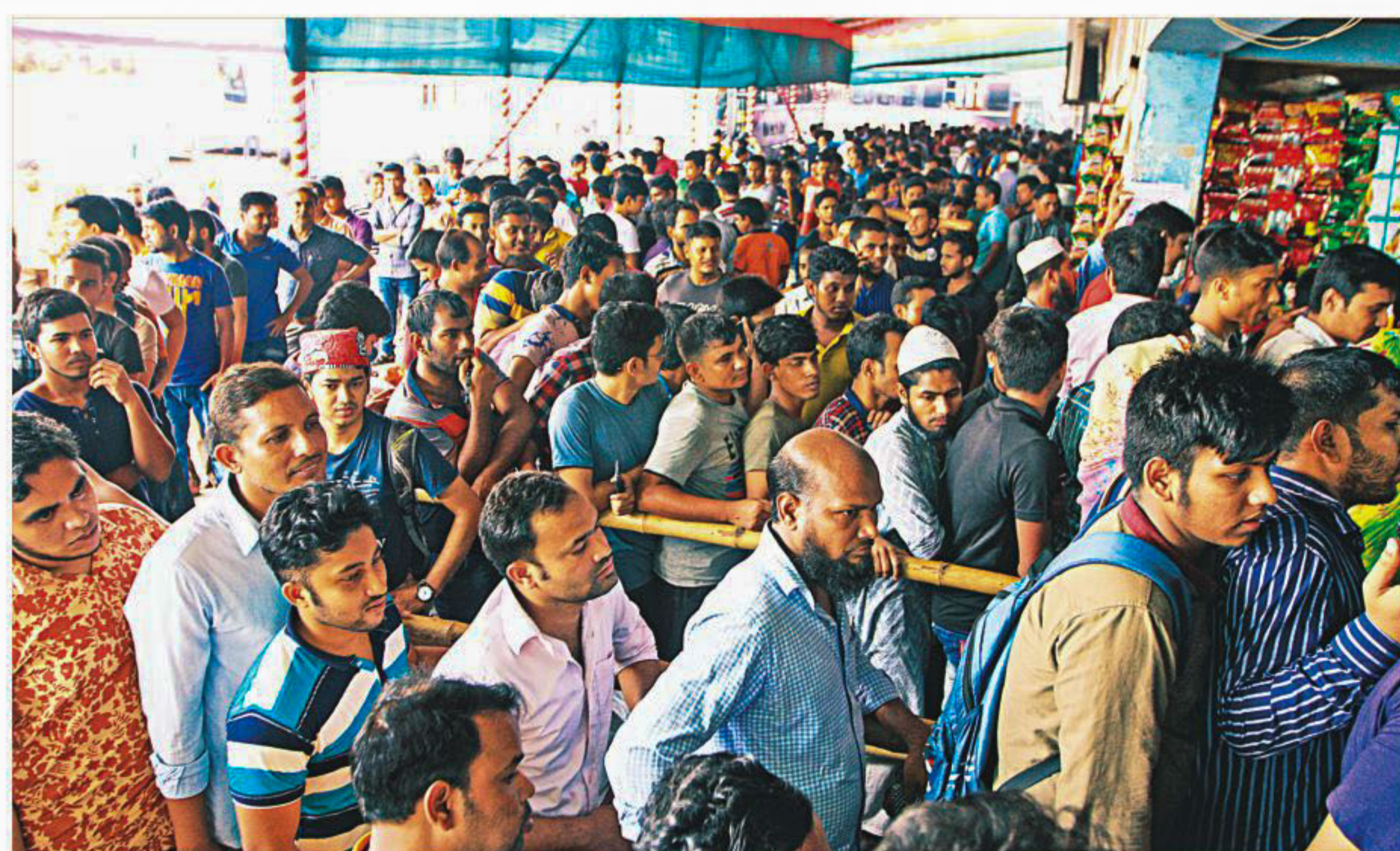
A huge crowd gathers at a ticket counter of an intercity private bus operator in Dhaka's Gabtoli area, as advance sale of bus tickets ahead of Eid holidays started yesterday.