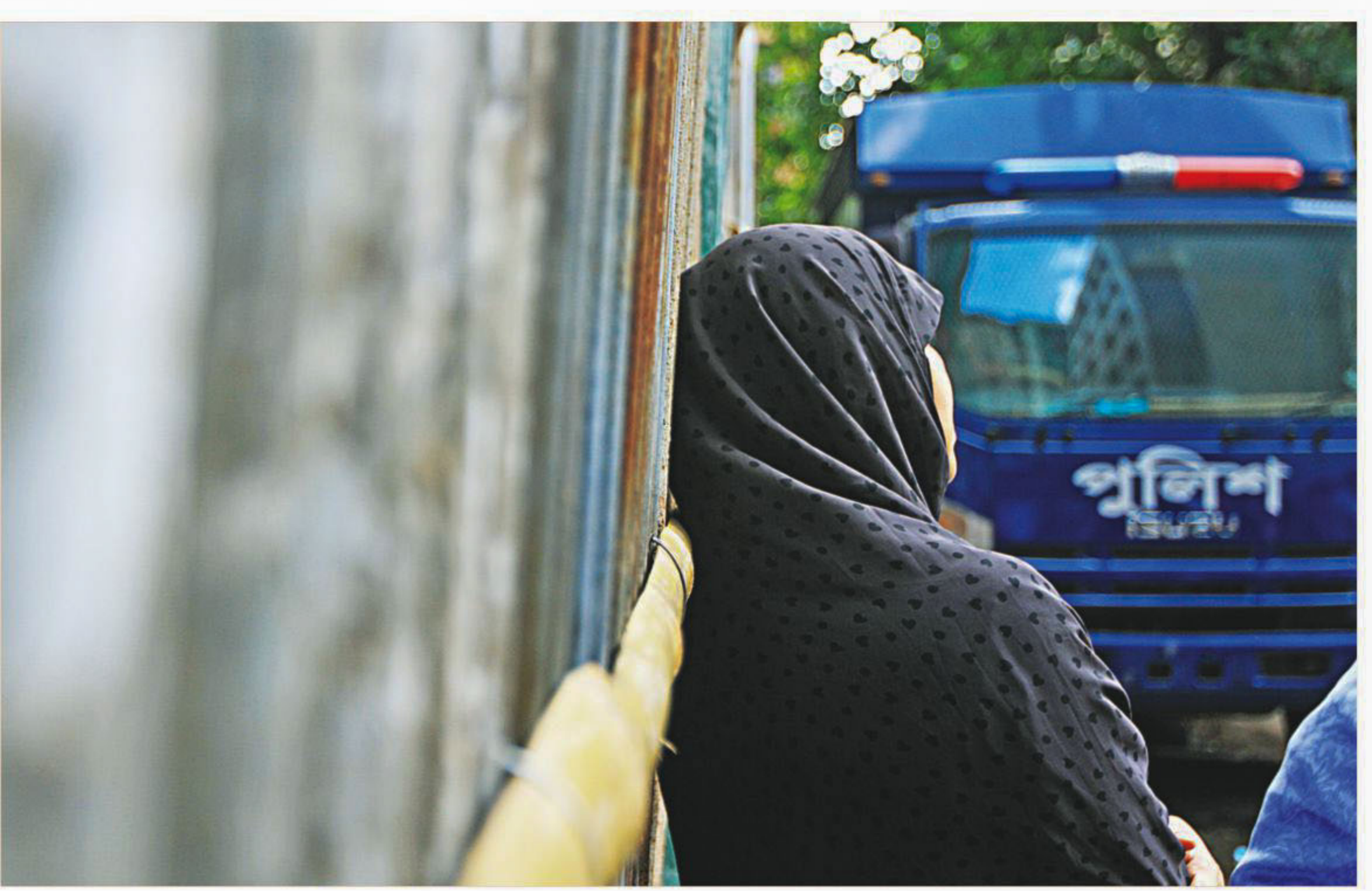
A woman waits leaning against the boundary wall of Dhaka CMM court after her son, a North South University student arrested during Monday's clash with police, was produced before the court yesterday.

Light to moderate rain/thunder showers accompanied with temporary gusty wind may occur at many places over Dhaka, Khulna, Barisal & Chittagong divisions and at a few places over Rajshahi, Rangpur, Mymensingh & Sylhet divisions, with moderate to heavy falls at places over the country in next 24 hours till 6:00pm today, UNB said quoting the Met office. The sun sets in the capital today at 6:37pm and rises tomorrow at 5:31am.