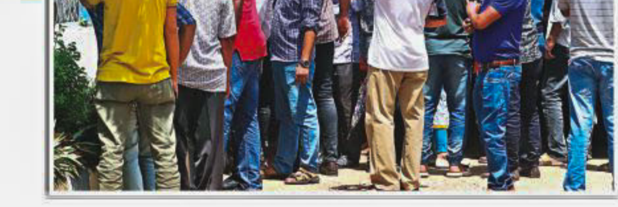
Some students, arrested during Monday's clash between private university students and police, being produced before a Dhaka court in handcuffs yesterday. Such a treatment goes against the police regulations, which say the use of handcuffs or ropes is "often an unnecessary indignity". Inset, anxious relatives through Tejaago Industrial Police Station to get other arrested students freed.