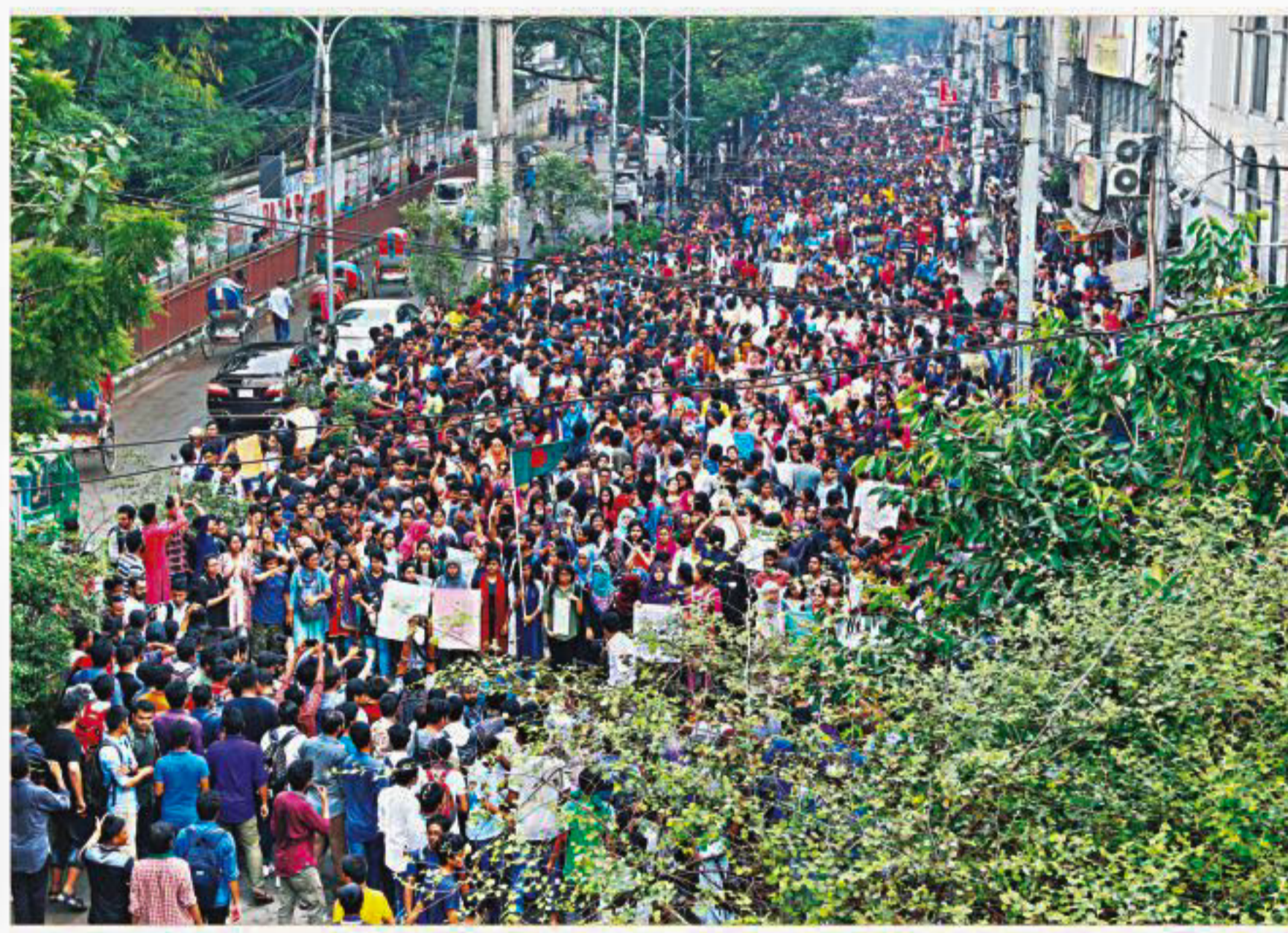
Students marching towards the Science Lab intersection from Shahbagh around noon yesterday.