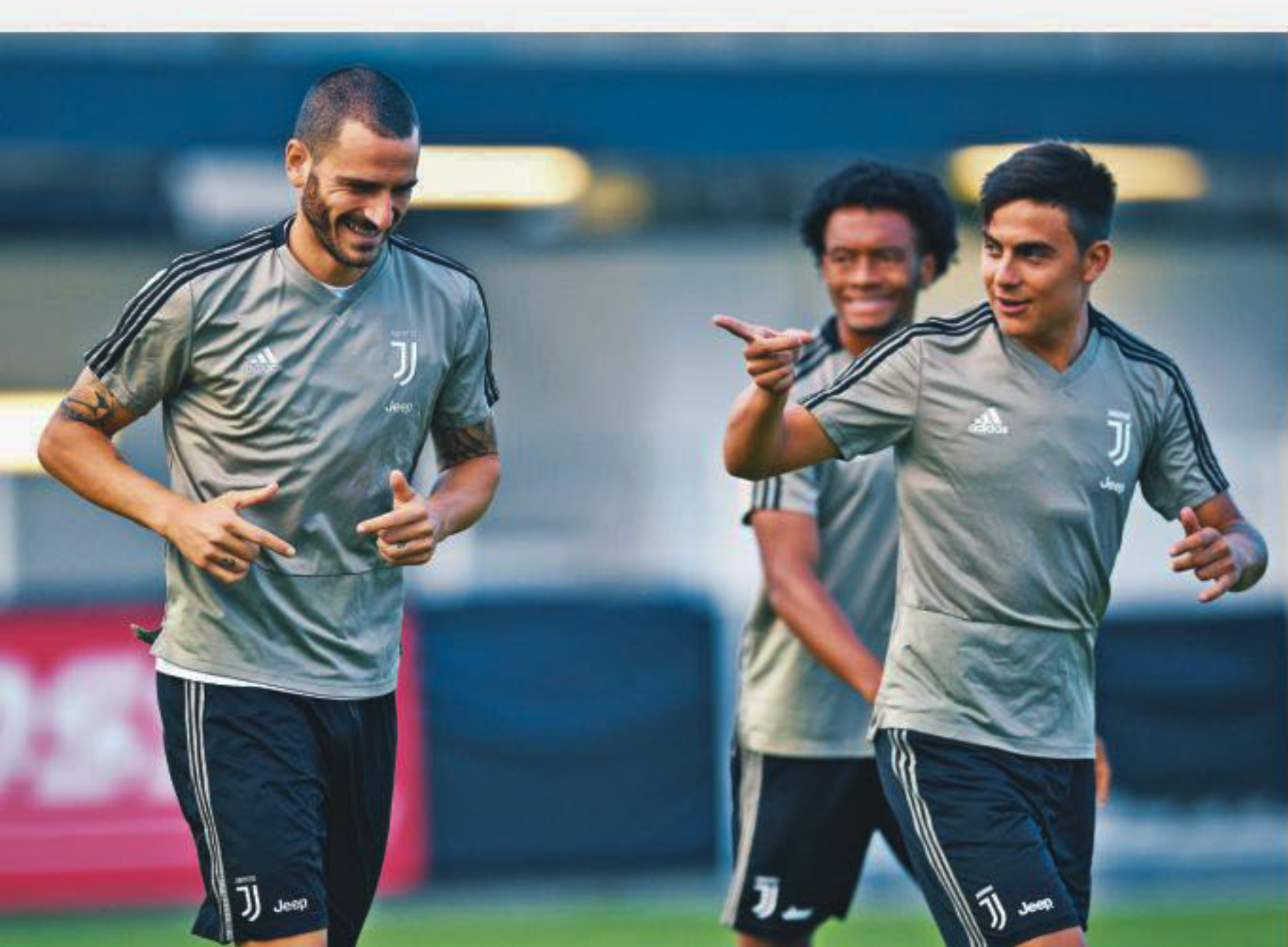
Juventus forward Paulo Dybala (R) shares a light moment with Leonardo Bonucci, who returned to the Old Lady after a year away at AC Milan, during a training session at the club's training facility in Turin yesterday.

Team BJMC wanted to make Rajshahi their home venue but the meeting declined their request.