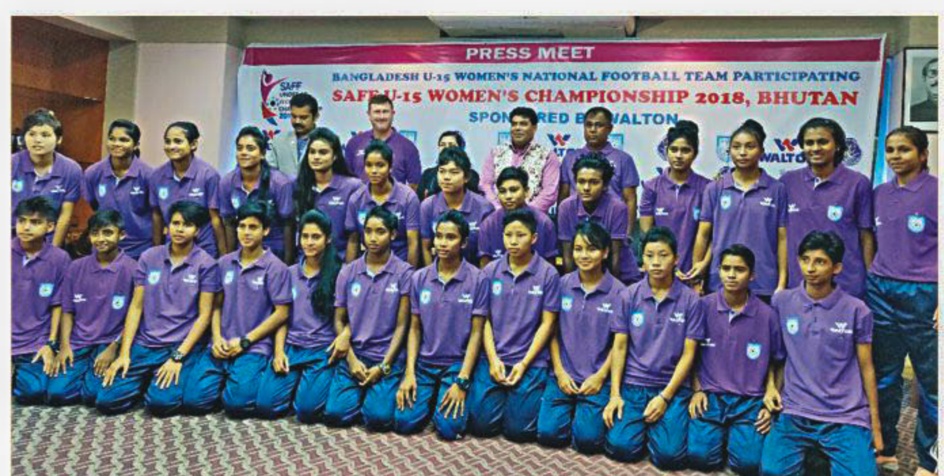
Bangladesh U-15 women team members and officials pose for a picture at the BFF House yesterday, ahead of their departure for Bhutan on Monday.