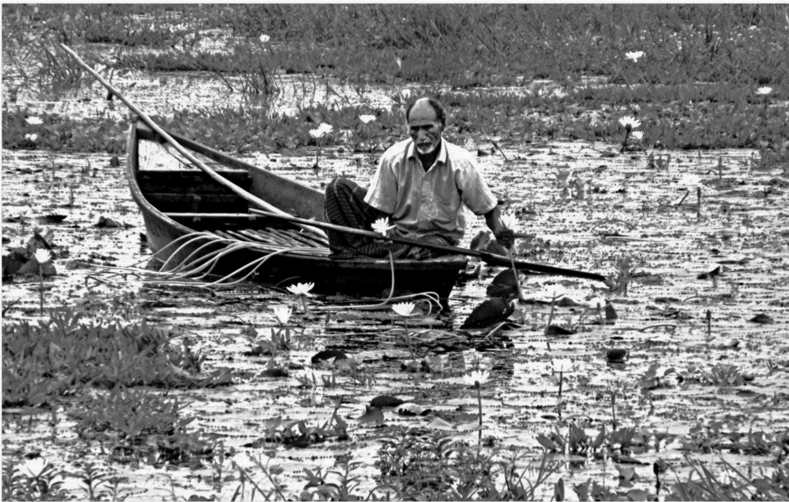
A man plucks water lilies from a water body in Munshiganj's Sirajdikhan. The national flower of Bangladesh, which is also consumed as a vegetable, is providing livelihoods to hundreds of families of the district during the monsoon, as arable land is usually inundated during the season.