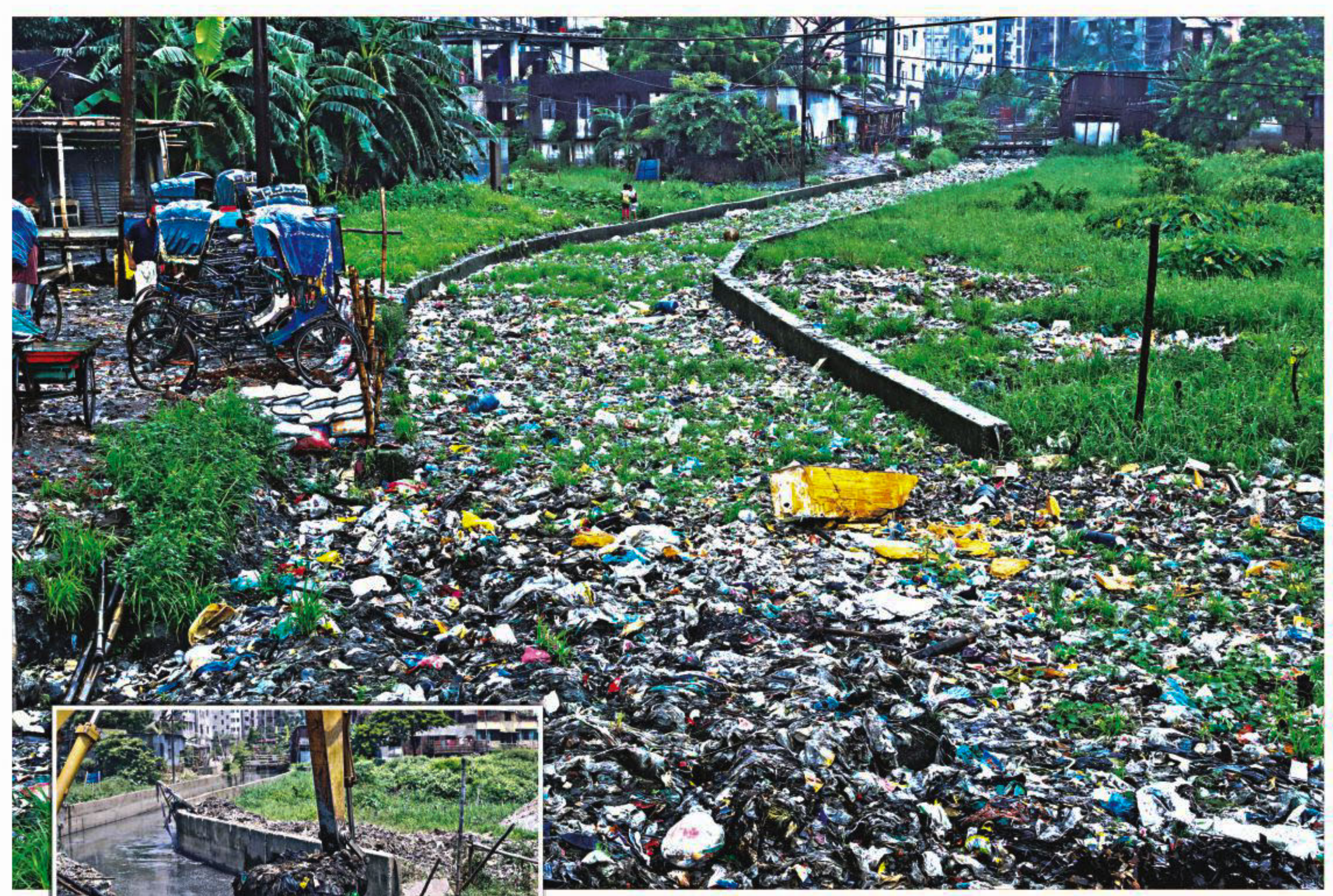
In this photo taken last week, the Basabo Canal is seen clogged with waste in Madinabagh of the capital's Mugdapara. The authorities had cleared the channel, inset, only about one and a half months ago, but unabated dumping of waste into the canal has brought things back to square one.