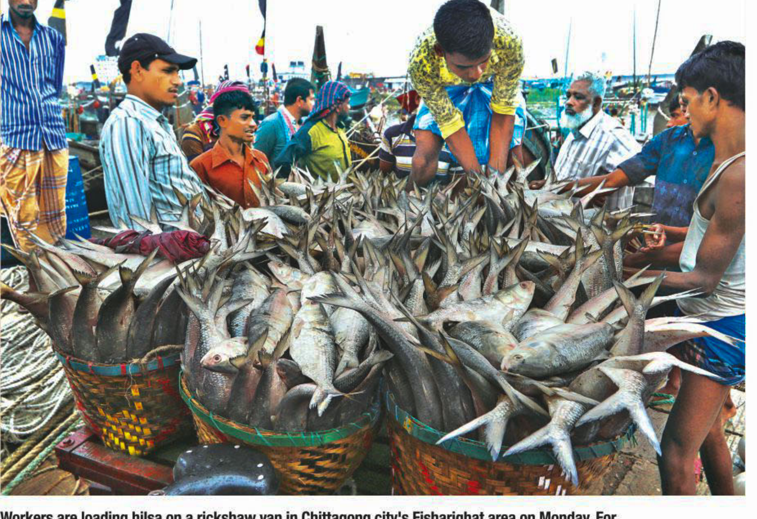
Workers are loading hilsa on a rickshaw van in Chittagong city's Fisharighat area on Monday. For the first time in this season, fishermen are bringing ashore good catches of hilsa and sending those to different markets. Prices of the fish ranged from Tk 350 to Tk 1,200 a kg depending on the size.