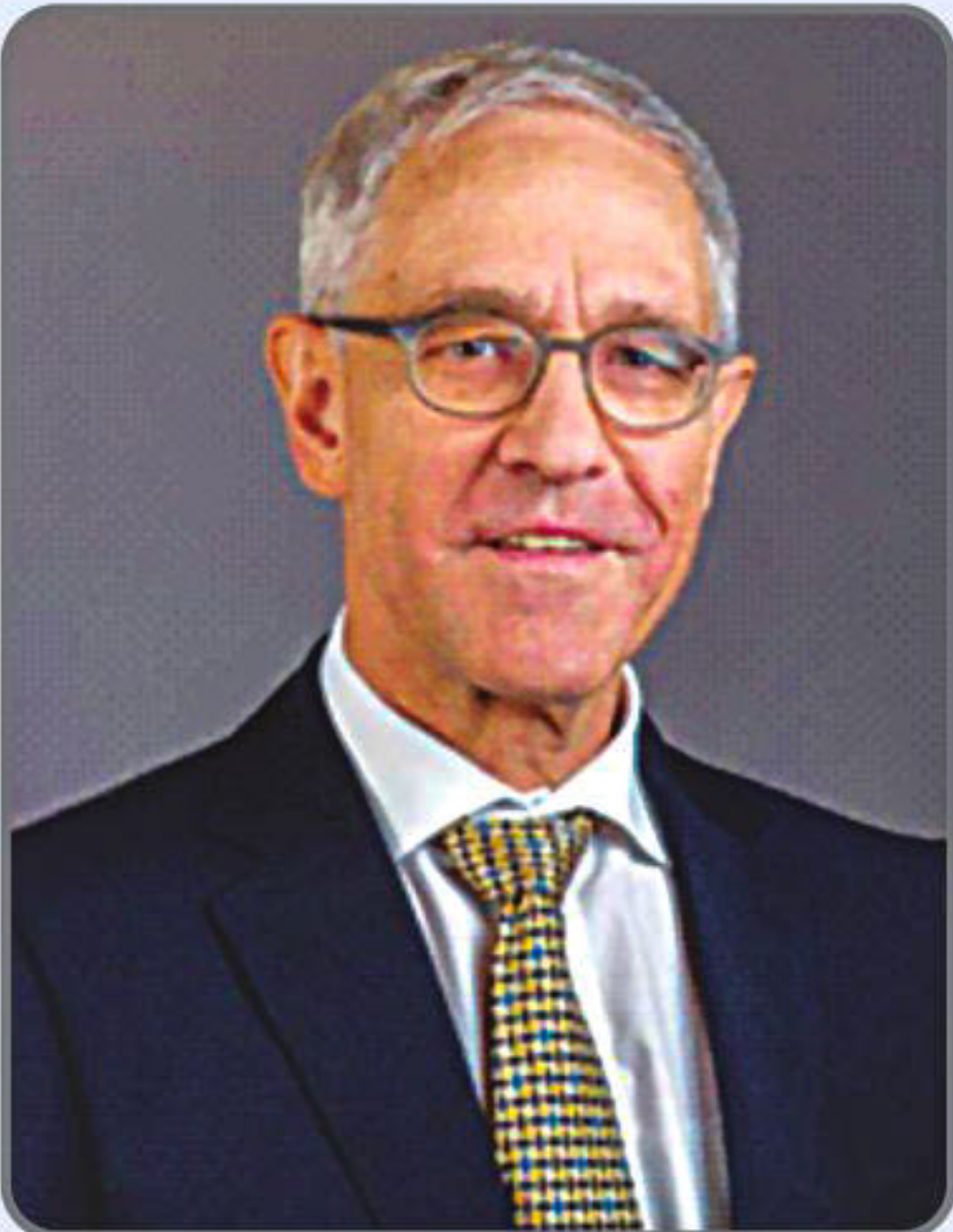
René Holenstein Ambassador of Switzerland to Bangladesh

Today is the National Day of Switzerland. On this special occasion, I wish to extend my best wishes and greetings to the people and the Government of Bangladesh. I would like to also offer felicitations to my fellow compatriots living in this beautiful country. Switzerland and Bangladesh enjoy long standing bilateral relations based on mutual respect and strong partnership. Switzerland was one of the first countries to establish bilateral relations with Bangladesh after its independence. Swiss priorities in the development cooperation with Bangladesh are aligned with Agenda 2030 and Bangladesh's national goals with a strong focus on facilitating people's socio-economic empowerment and wellbeing. At the same time, bilateral trade and investment ties are growing rapidly. While development and