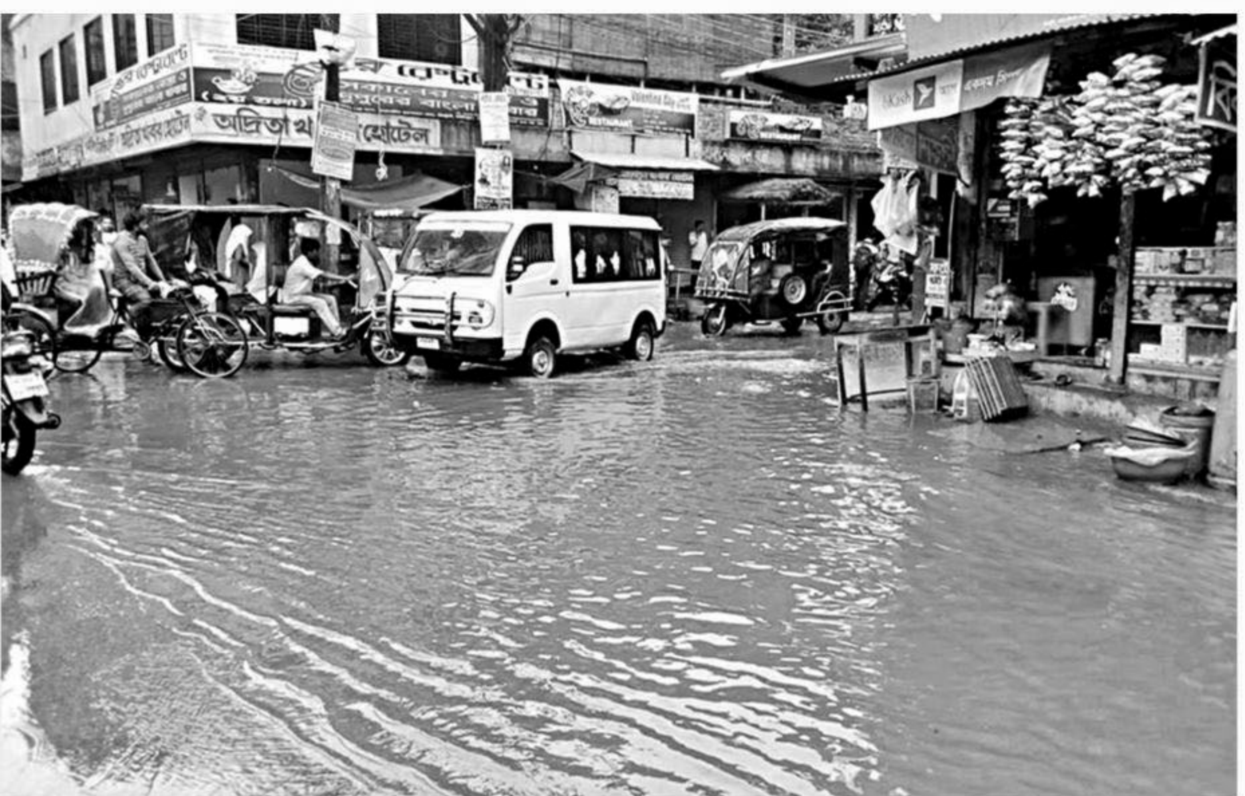
A waterlogged road in front of Adarsha Girls' High School in Faridpur town. The photo was taken a few days ago.

"Our city used to be free of waterlogging, but now waterlogging is increasing day by day due to the closing of the mouth of a drain recently. We are trying our best to solve the problem as soon as possible," said Faridpur Municipality Mayor Sheikh Mohatab Ali Mathu.