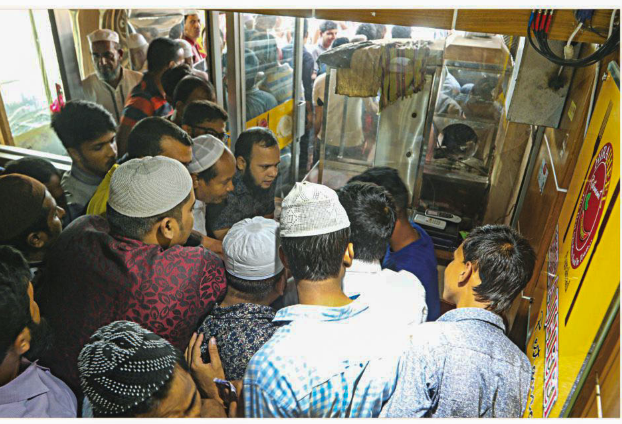
Faced with an acute shortage of gas, people jostle to buy food at a restaurant in port city's Agrabad area on Friday.