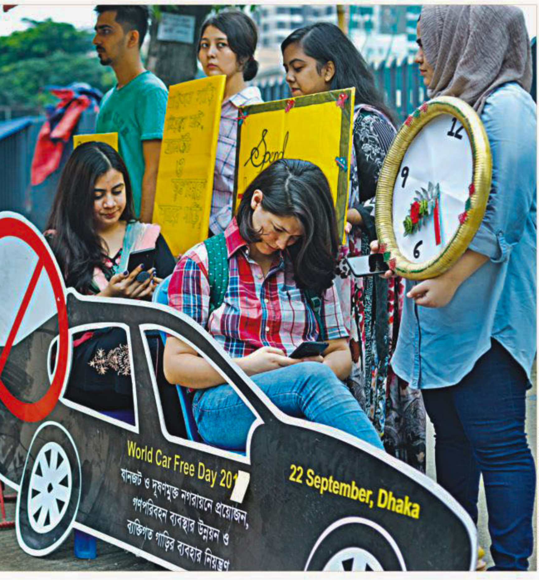
Campaigners take part in a performance to demonstrate how passengers are forced to kill valuable time on the road due to traffic jams. Inset, a car accident scene is enacted. The event is a symbolic representation of the present traffic situation in Dhaka city, which is aggravated by a large number of private cars. It was organised at Abahani playground by Car-free Cities Alliance Bangladesh, a campaign launched by the Institute of Wellbeing yesterday. In Dhaka city, people lose 32 lakh work hours to traffic jams every day, and its economic cost is Tk 30,000 crore, says a press release.