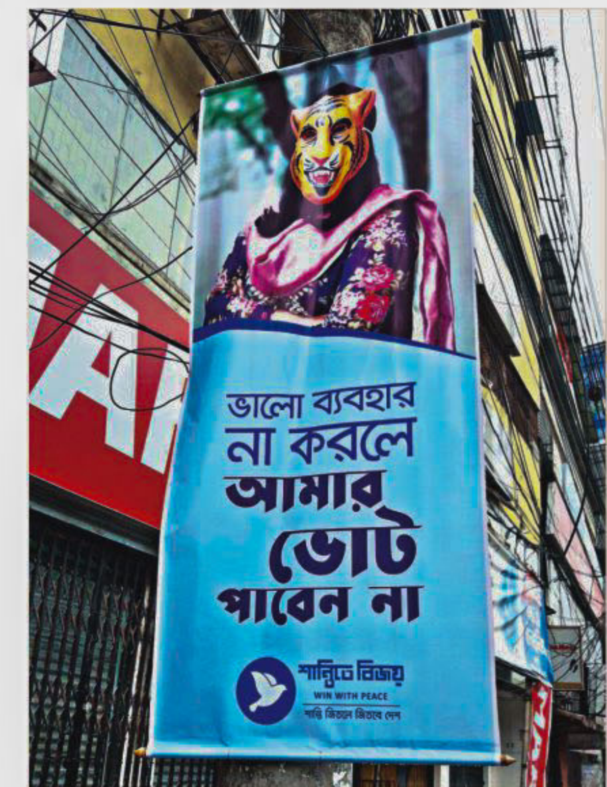
"Treat me well or it will cost you my vote." A woman, wearing a mask in a symbolic attempt to represent all the voters, gives the message to the candidates of the Rajshahi City Corporation election due Monday. The roll-up was put up on Shaheb Bazar road of the city, by Win with Peace, a campaign of Democracy International.