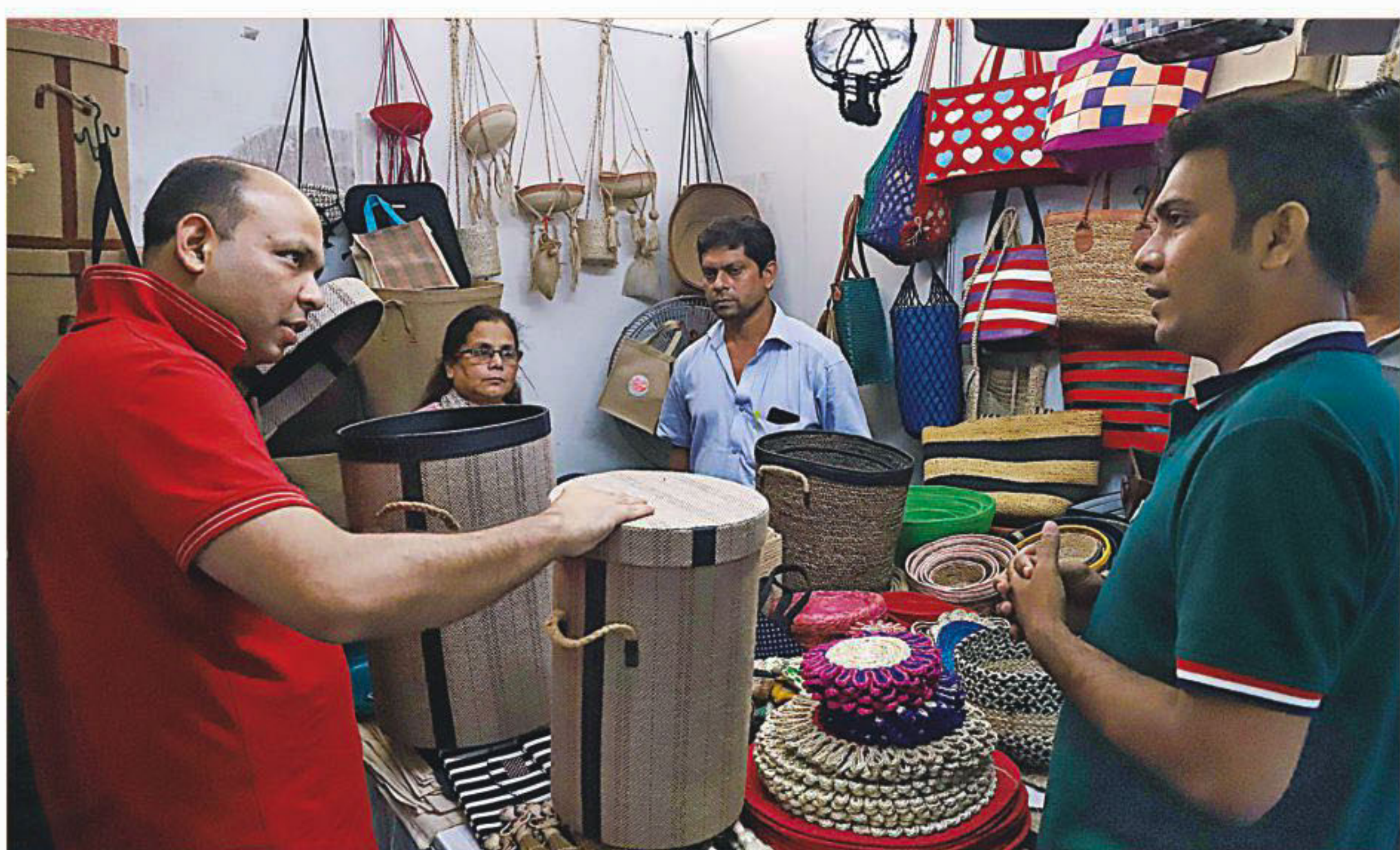
Jute goods garner attention at a Poribesh Mela (environment fair) in the capital's Sher-e-Bangla Nagar yesterday. The Department of Environment organised the weeklong fair that began on July 18.