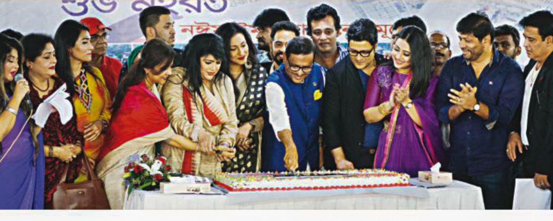
The Minister of Road Transport and Bridges Obaidul Qader and Minister of Information Tarana Halim with other guests at the ceremony.