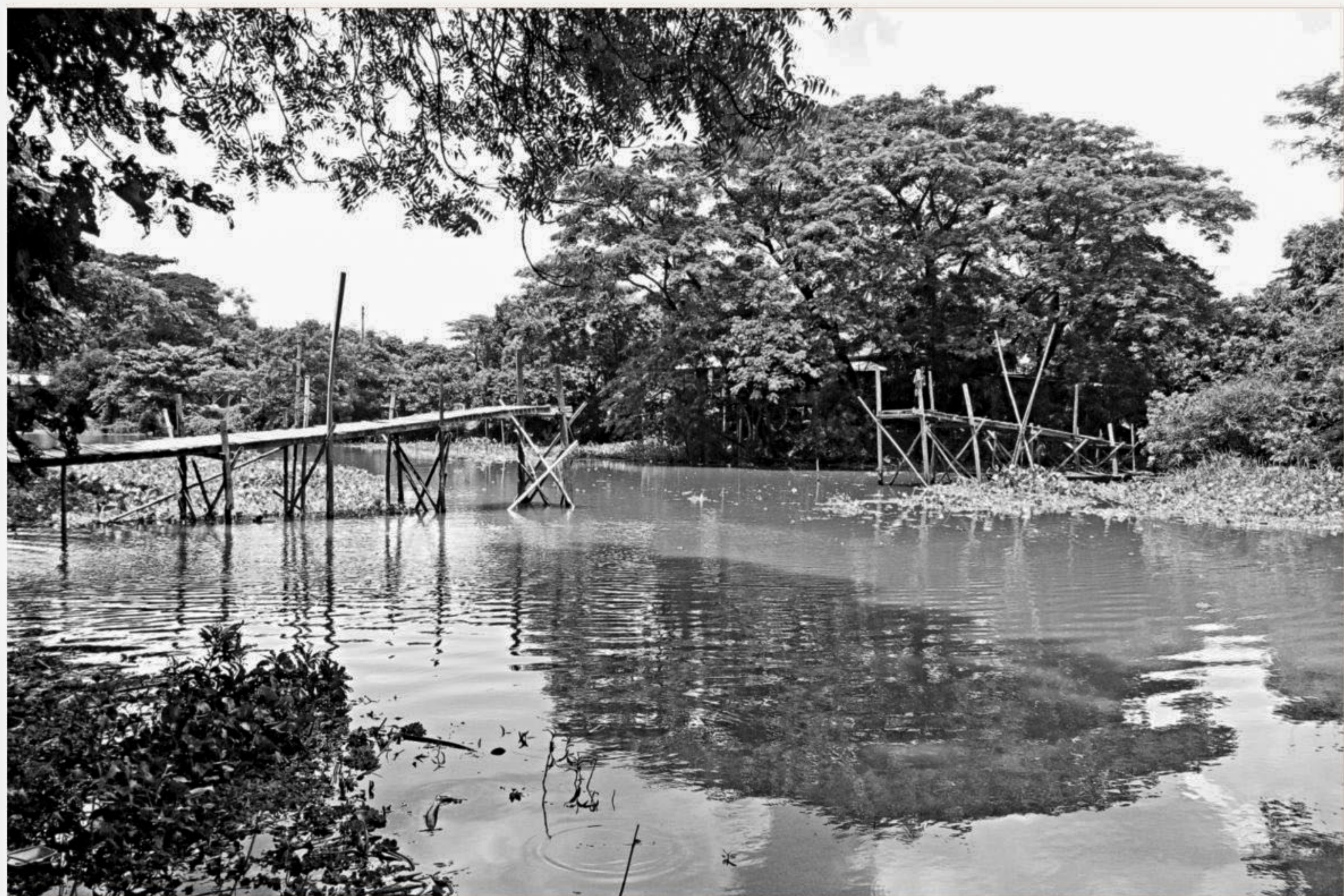
This wooden bridge on Syedpur canal near Bhairab Bari launch terminal in Shologhar union under Sreenagar upazila of Munshiganj lies useless for a couple of months during the ongoing rainy season as a syndicate of sand traders removed its middle part to enable movement of sand carrying boats.