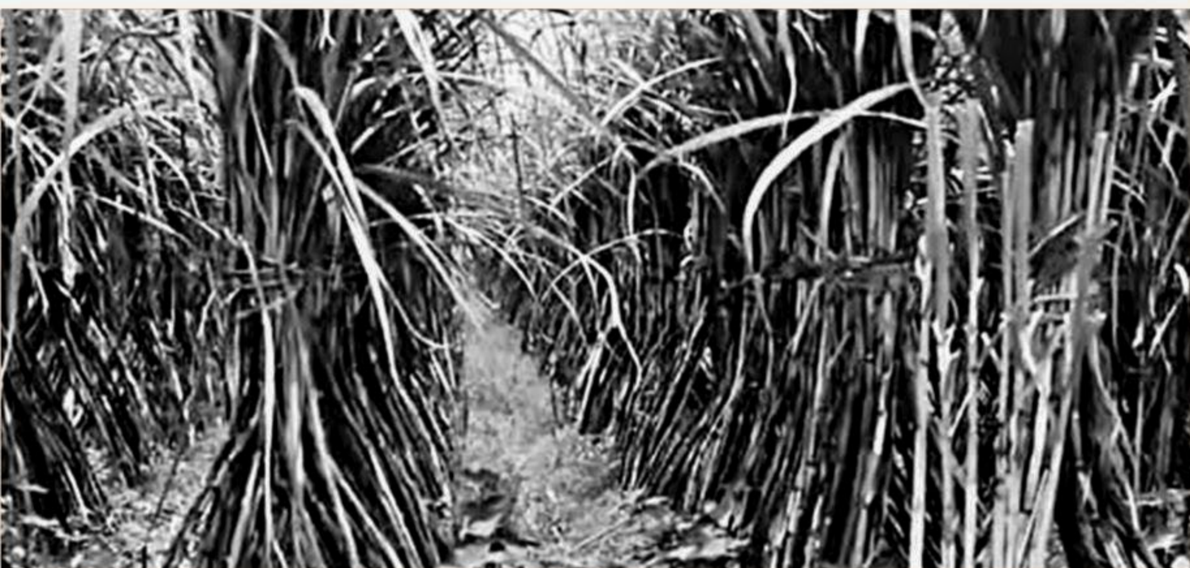
A Q-16 variety of HYV sugarcane field in Gobindaganj upazila of Gaibandha.

This year 17 hectares of land has been brought under its cultivation in the upazila.