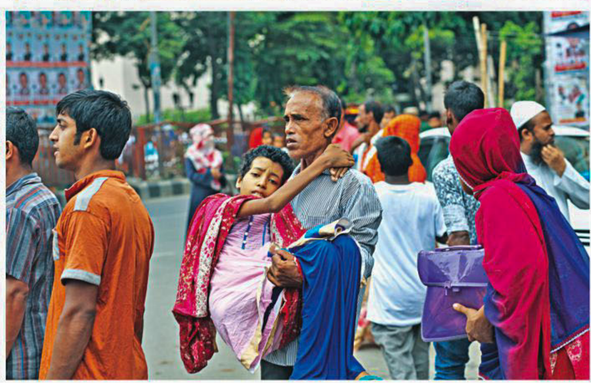
These photos of processions heading towards Suhrawardy Udyan and commuters were taken from Bangla Motor and Shahbhagh.