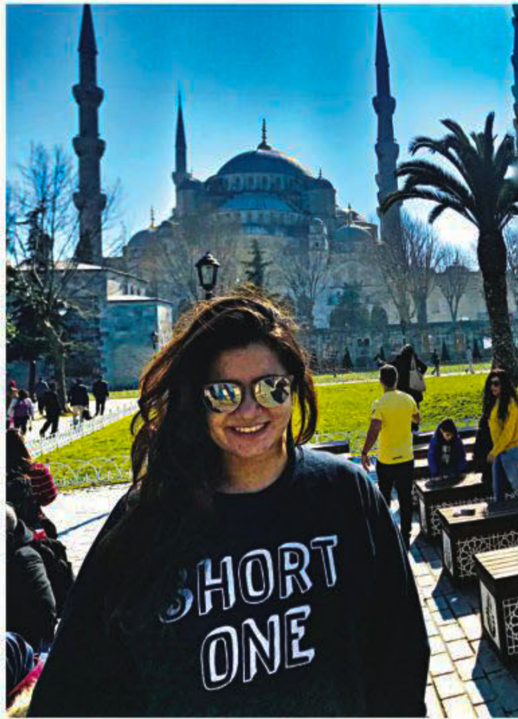
The author in front of the Blue Mosque, Istanbul

Here's how it works for Bangladeshi passport holders—you cannot enter Turkey unless you either have a valid Turkish visa; alternatively, you can purchase e-Visas online if you have a valid Schengen, Ireland, UK, Canada or US visa. Having acquired a multiple entry Schengen visa in Abuja, I applied