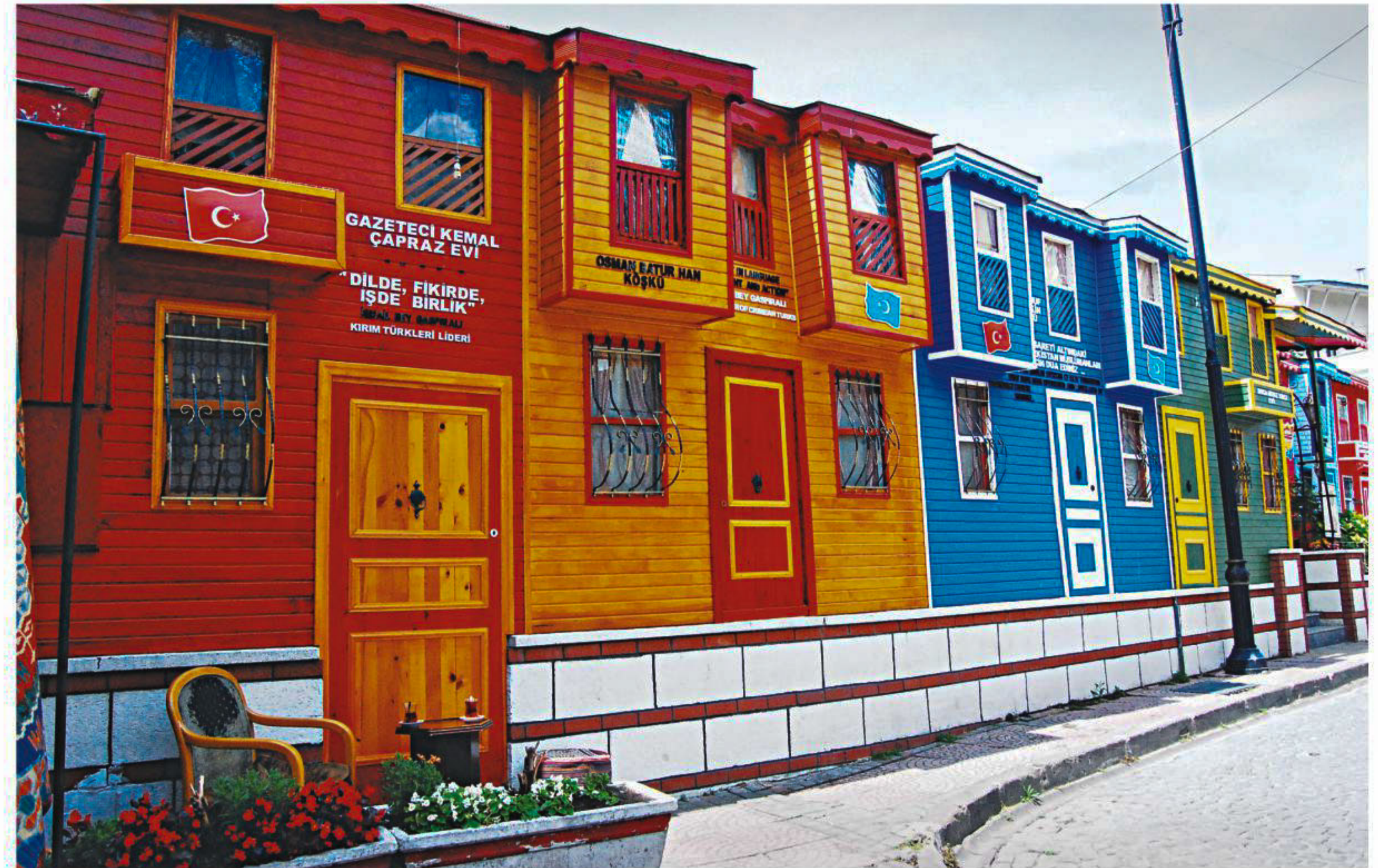
Colourful houses in Sultanahmet, Istanbul

Ultimately, in spite of Turkey's somewhat lax visa regulations, it is still prejudiced towards citizens of certain