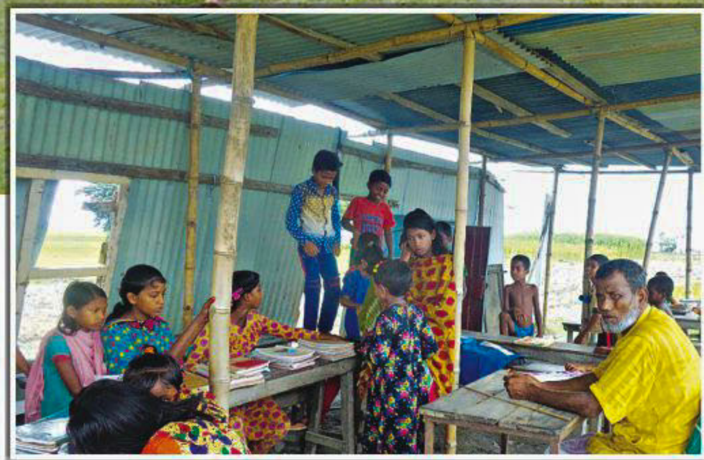
It is hard to believe this makeshift structure, made of corrugated iron sheets and bamboo poles, is Purba Satunama Aminpara Government Primary School in Nilphamari's Dimla upazila. Inset, students attending class. The photos were taken recently.