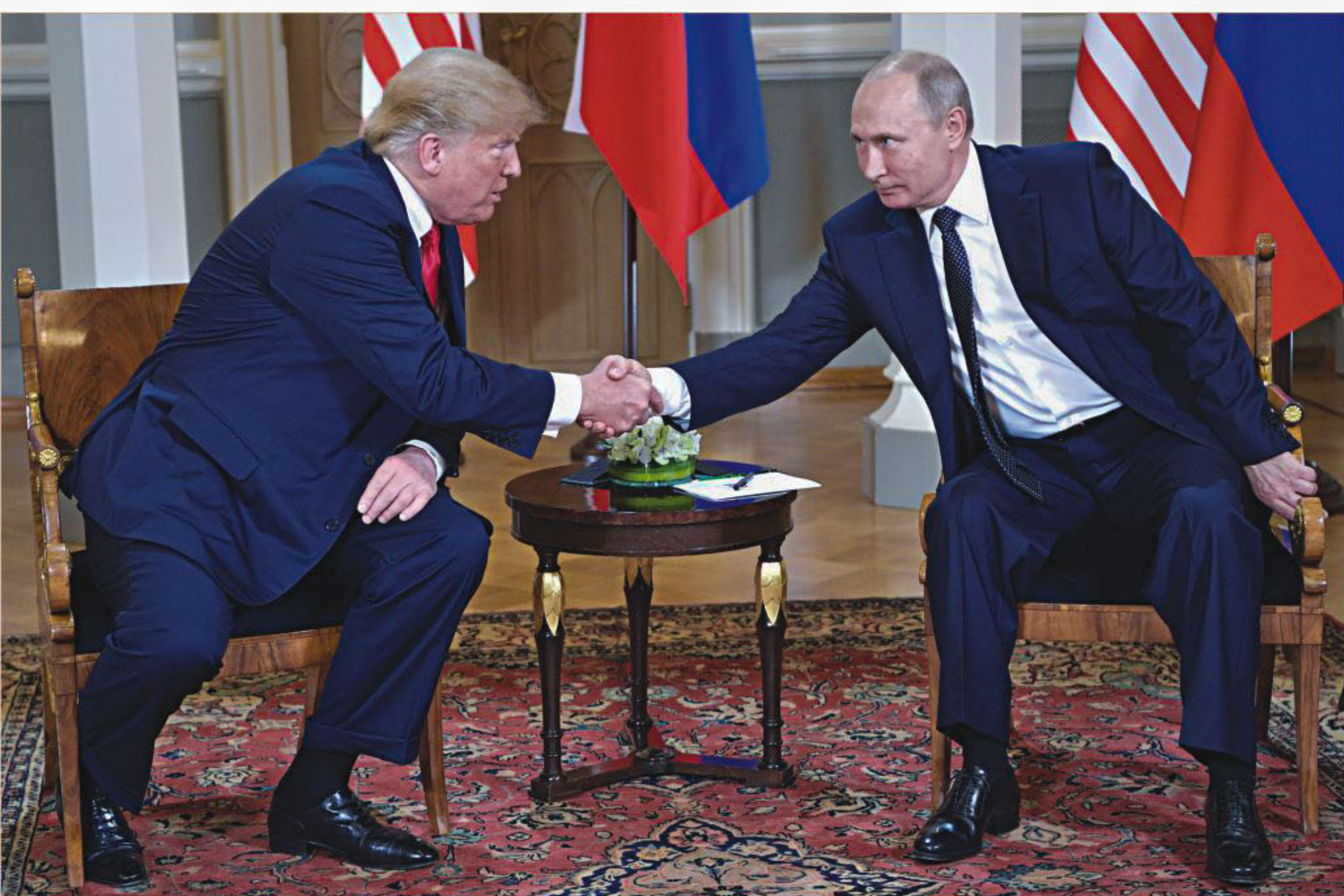
Russian President Vladimir Putin and US President Donald Trump shake hands before a meeting in Helsinki, yesterday.