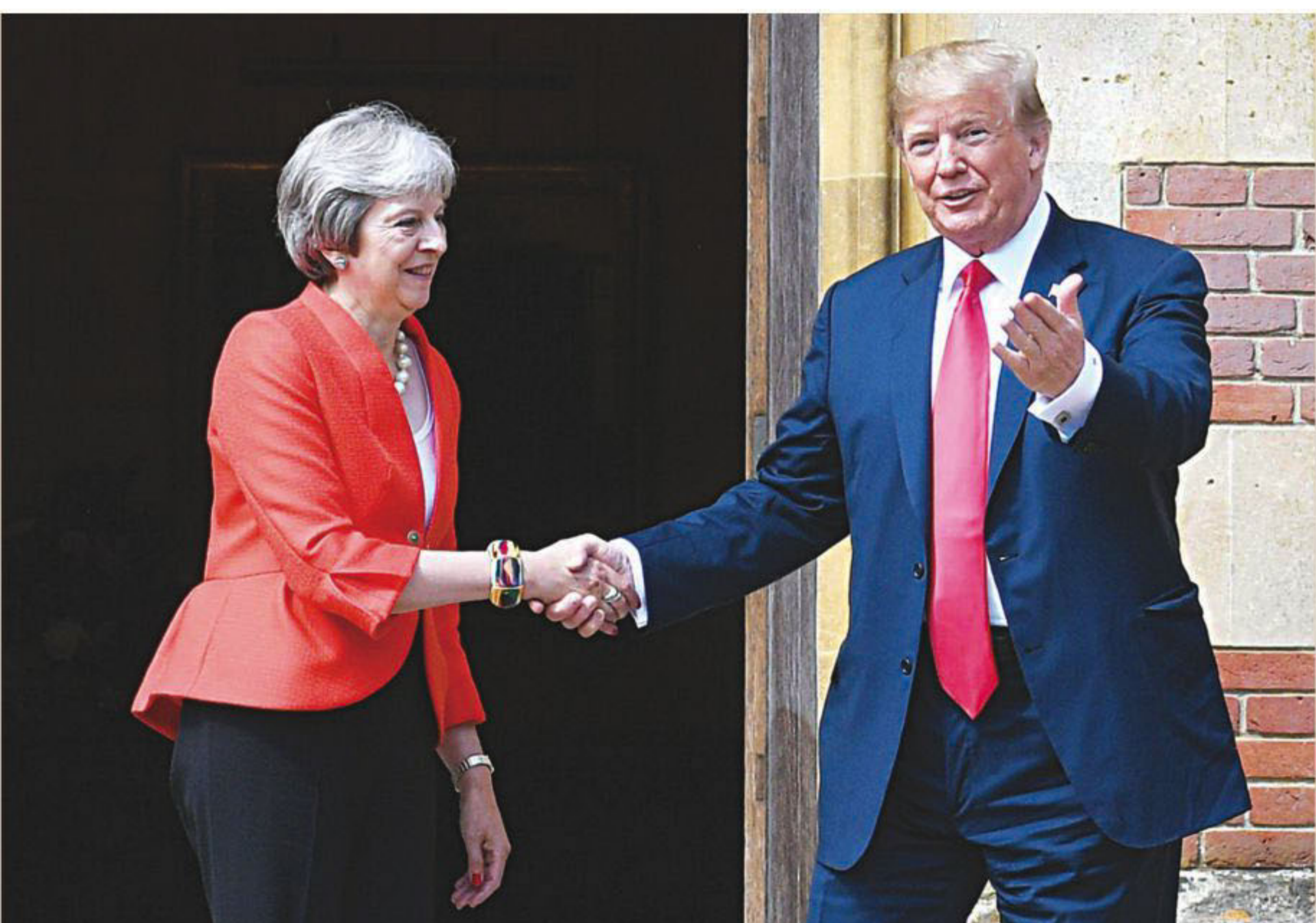
US President Donald Trump and British Prime Minister Theresa May shake hands upon Trump's arrival for a meeting at Chequers, the prime minister's country residence, near Ellesborough, northwest of London yesterday. More on page 11.