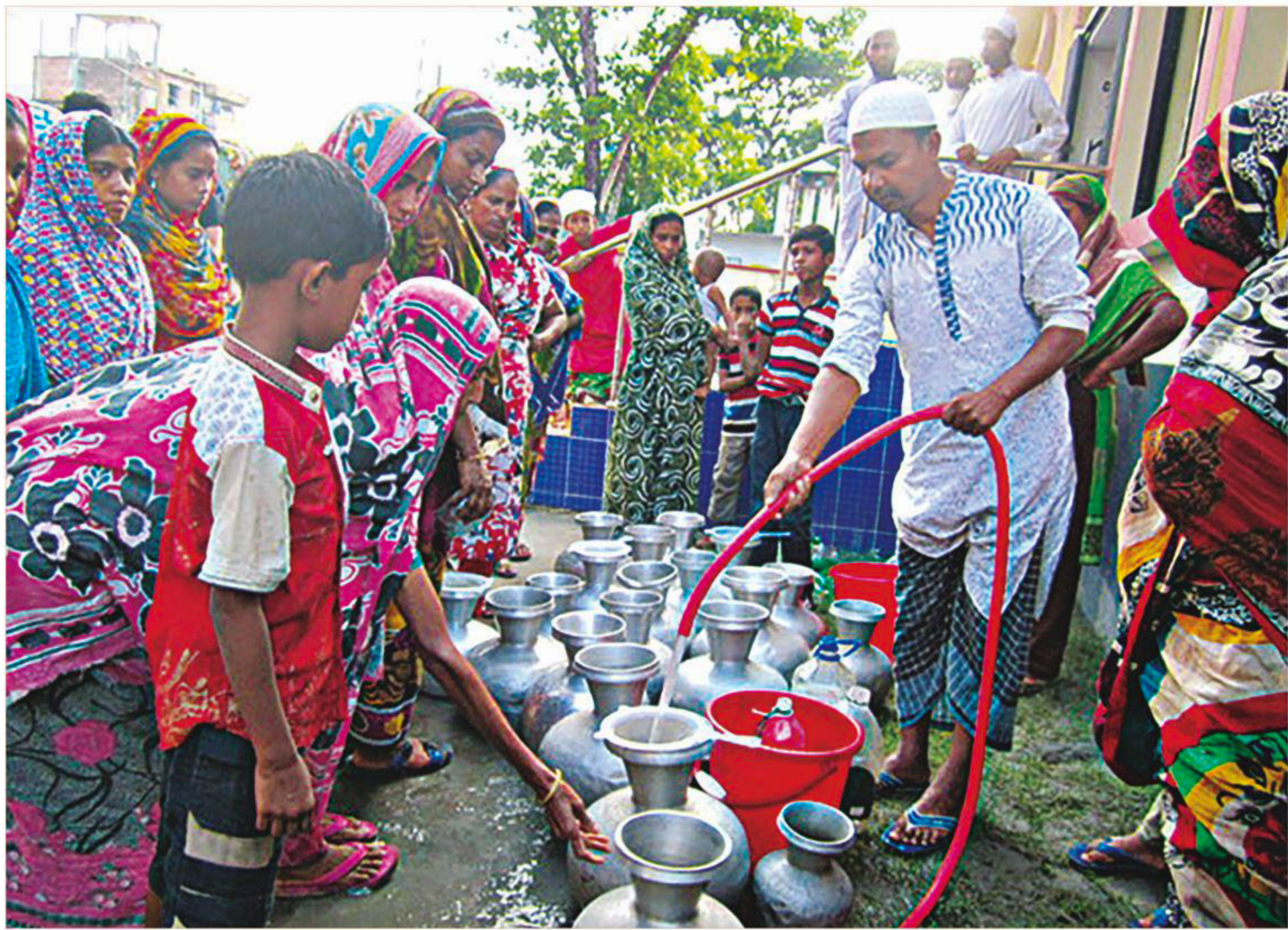
People queue up in Patuakhali town's Puran Hospital area to collect drinking water from a deep tube-well at Baitul Aman mosque. Residents of the town have been hit hard by water crisis over the last four months as the Patuakhali Municipality is failing to supply enough water to households due to a fall in groundwater level. The photo was taken last month.

Patuakhali's deep tube-wells run dry as water table drops