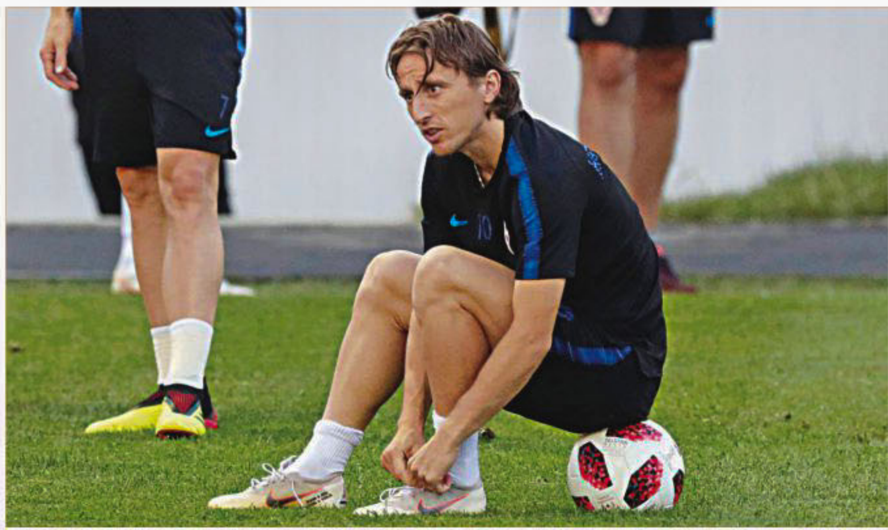
Croatia captain Luka Modric takes a breather during training.