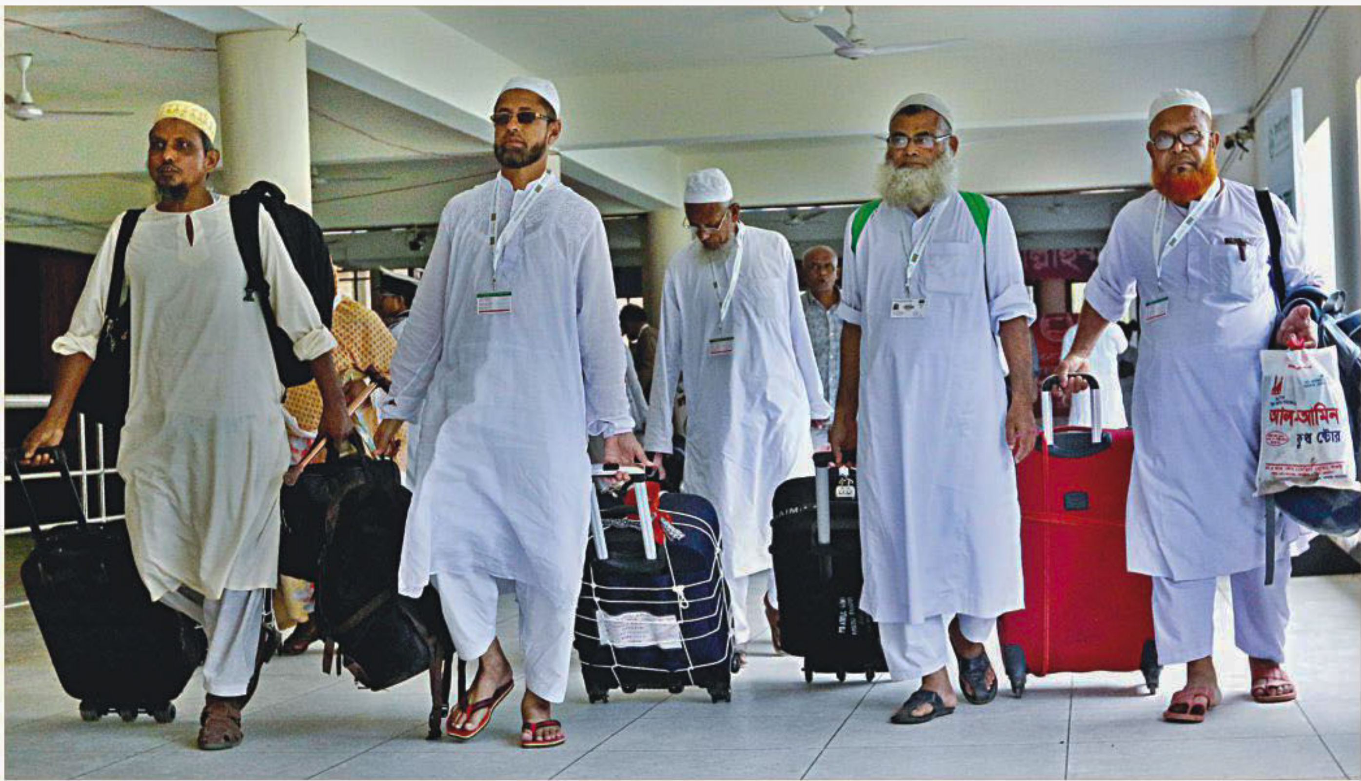
Pilgrims arrive at Hajj Camp in the capital's Ashkona yesterday. This year's first hajj flight carrying Bangladeshi pilgrims will depart from Dhaka for Jeddah today.