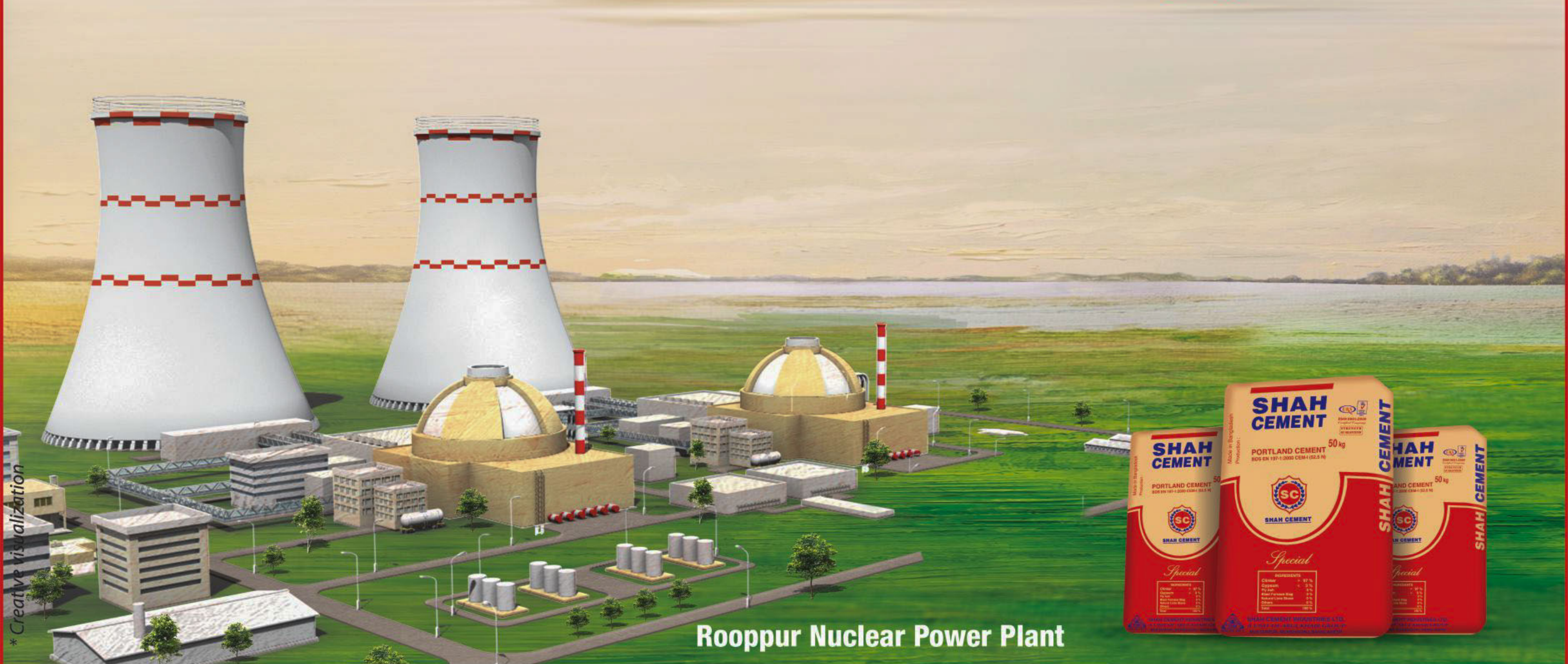
Rooppur Nuclear Power Plant