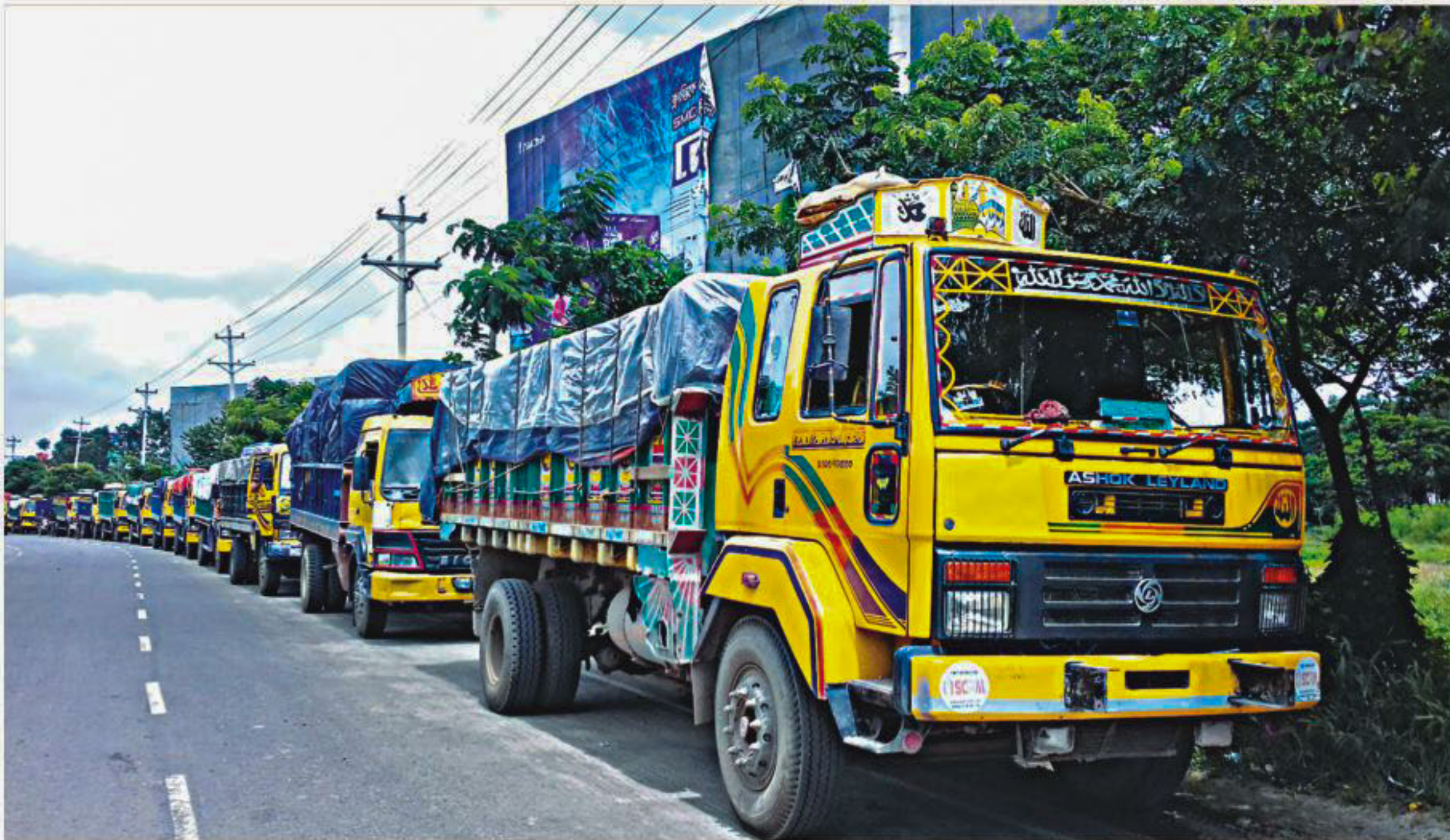
Hundreds of trucks queue on the Dhaka-Mawa highway, waiting to cross the Padma near Shimulia Ferry Terminal. Strong currents and fewer vessels in service are causing delays in the crossings.