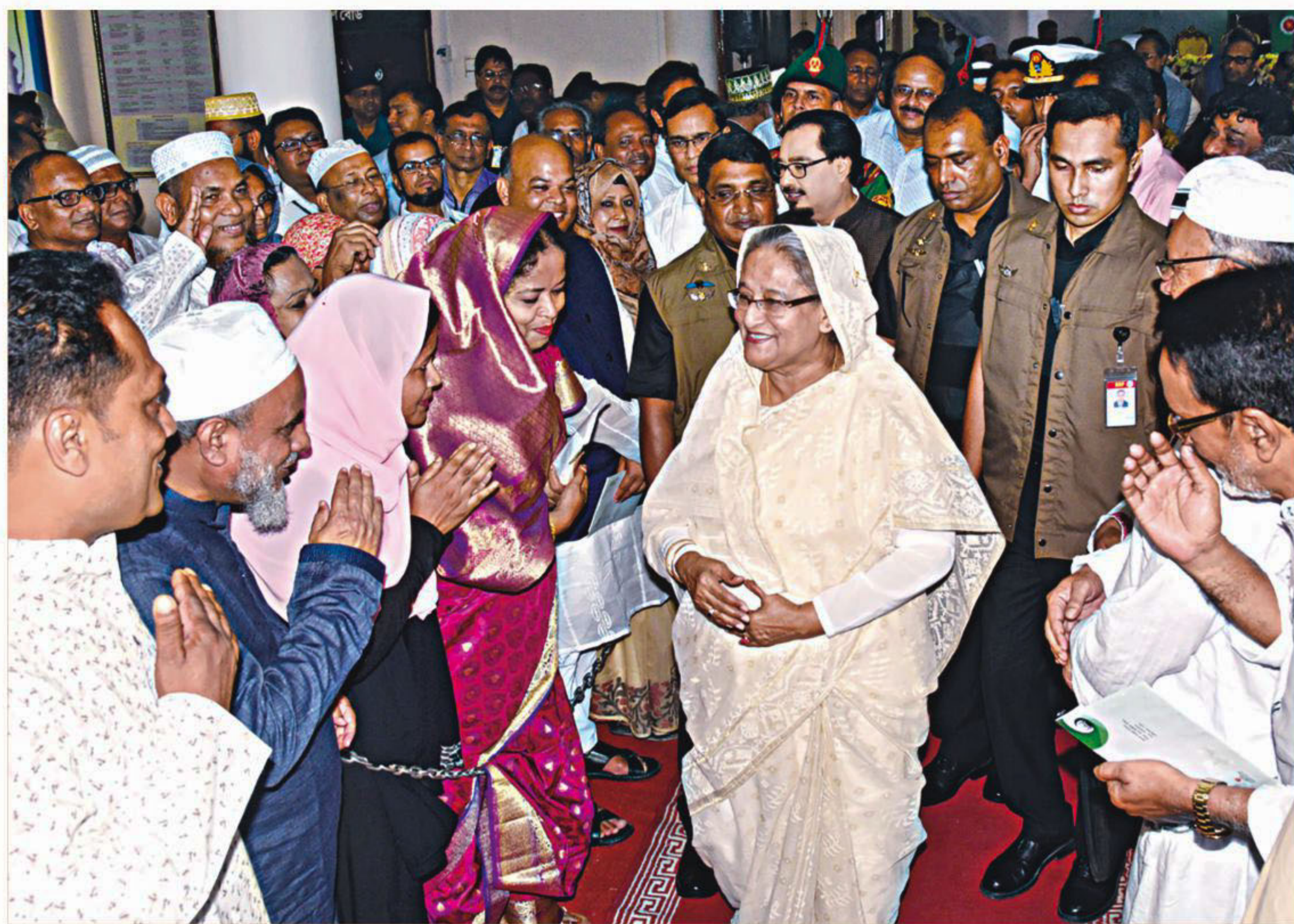
Prime Minister Sheikh Hasina and pilgrims exchange greetings at Ashkona Hajj Camp after she inaugurated the 2018 hajj programme yesterday.