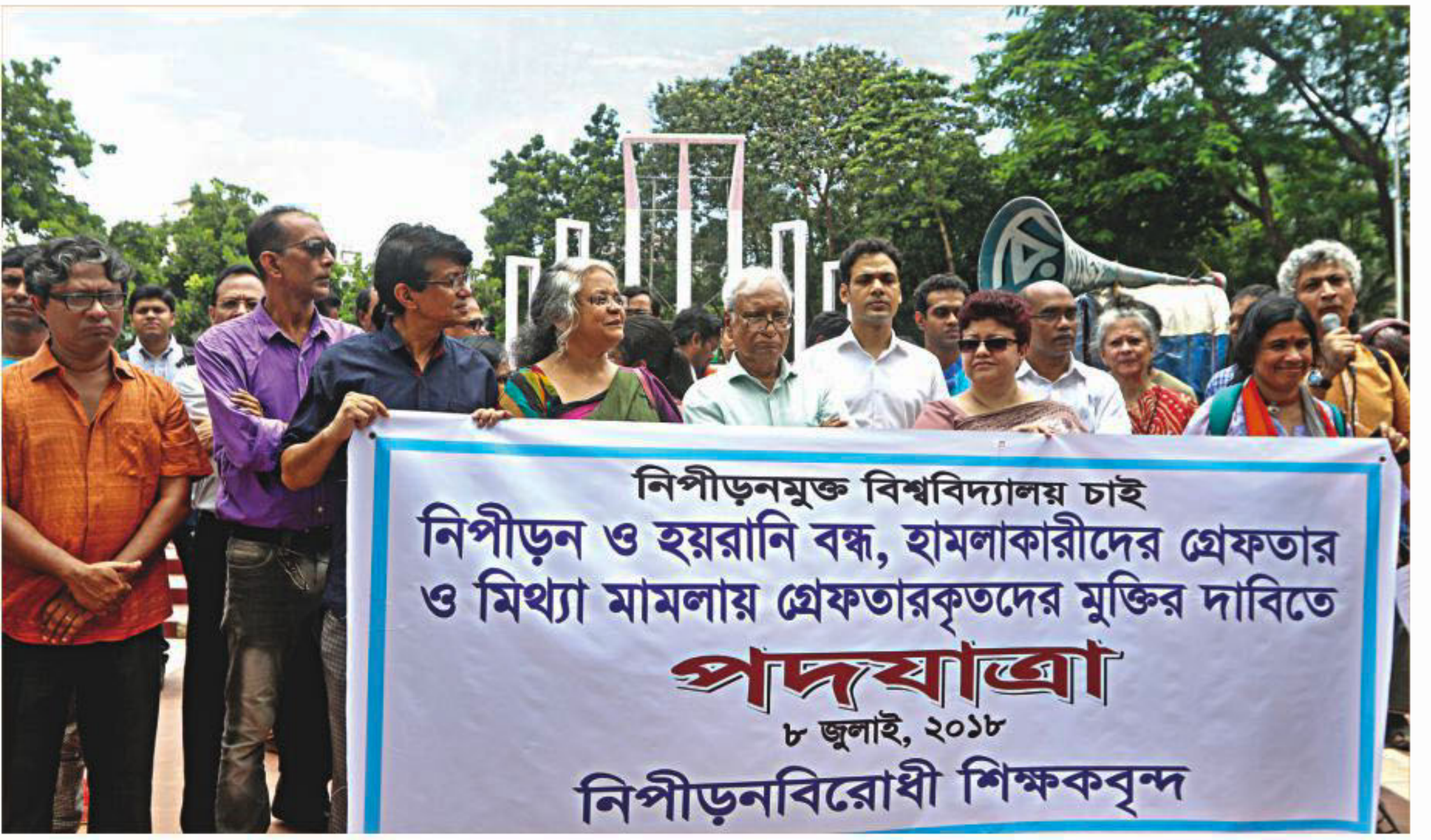
Dhaka University teachers hold a rally at the Central Shaheed Minar yesterday, demanding a stop to attacks on general students taking part in quota reform demonstration and harassment of the protesters through filing cases against them.