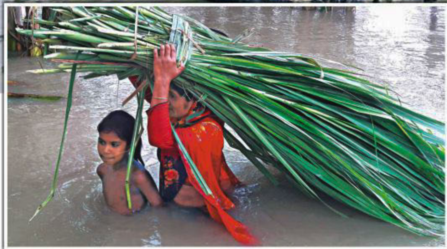
People arriving at a primary school used as a flood shelter in Jankarkandi area of No 8 Kandigao union in Sylhet Sadar upazila yesterday. Inset, a woman along with her child wades through waist-deep water to go to the mainland as floodwater entered her house at Majher Char in the Dharla river in Lalmonirhat.