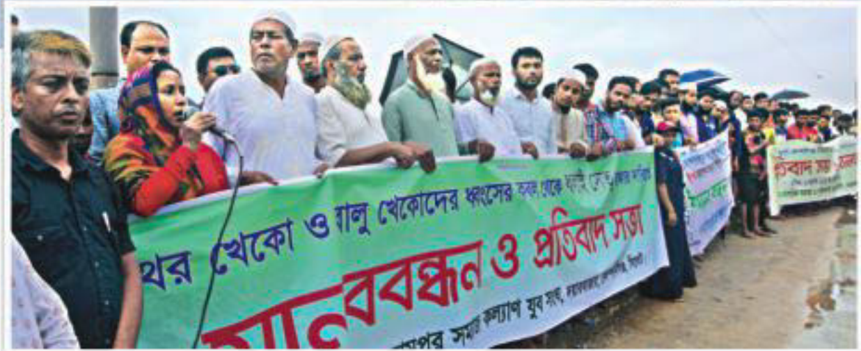
A cluster of boats dredge up sand from the Dhalai river. Inset, locals form a human chain on the Dhalai bridge, demanding immediate stop to sand extraction around the bridge.