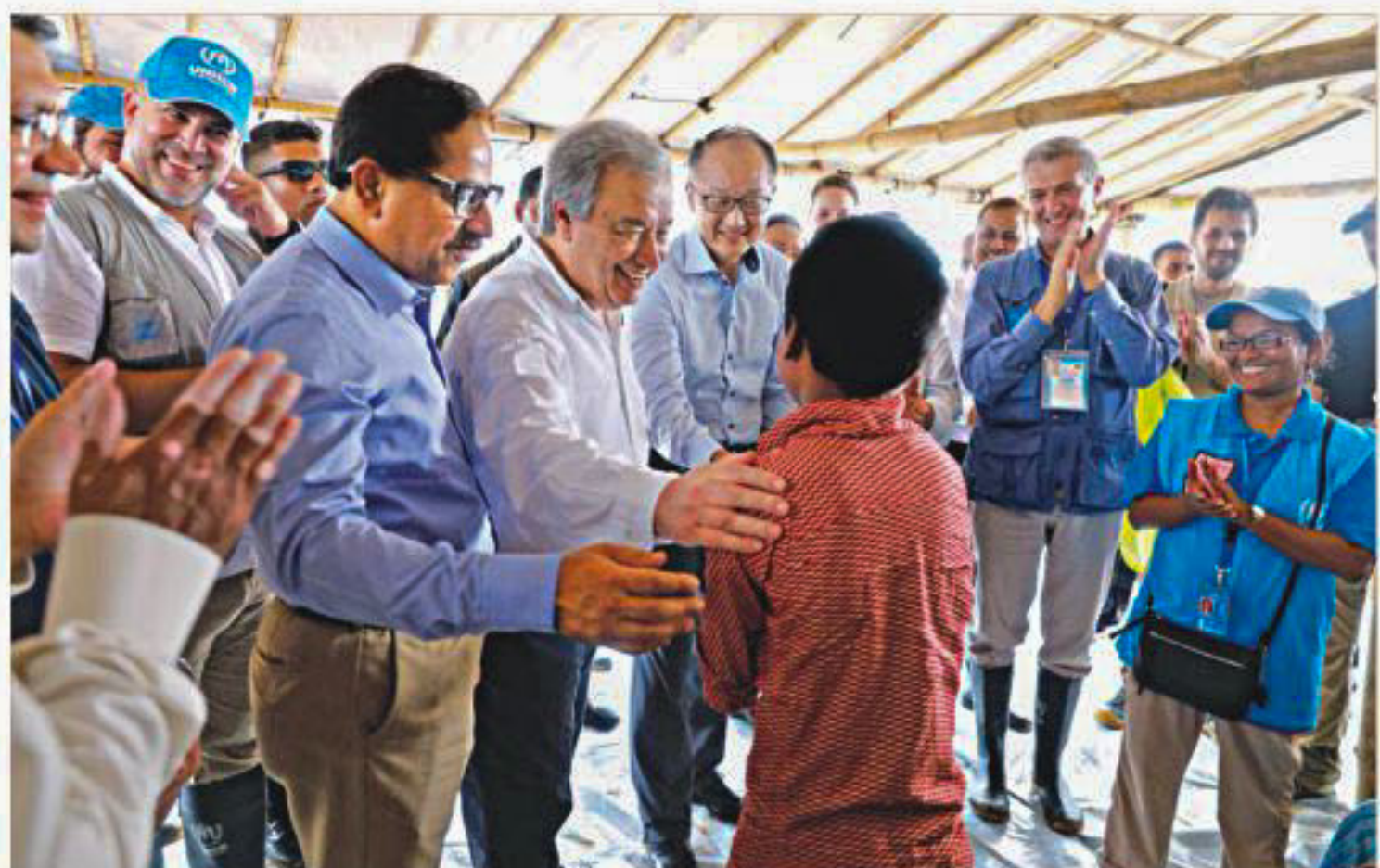
UN Secretary-General António Guterres talks to a boy at a Rohingya camp in Kutupalong yesterday.

UN secretary-general urges global support for Rohingyas, strong int'l pressure on Myanmar, listens to heartbreaking accounts of refugees