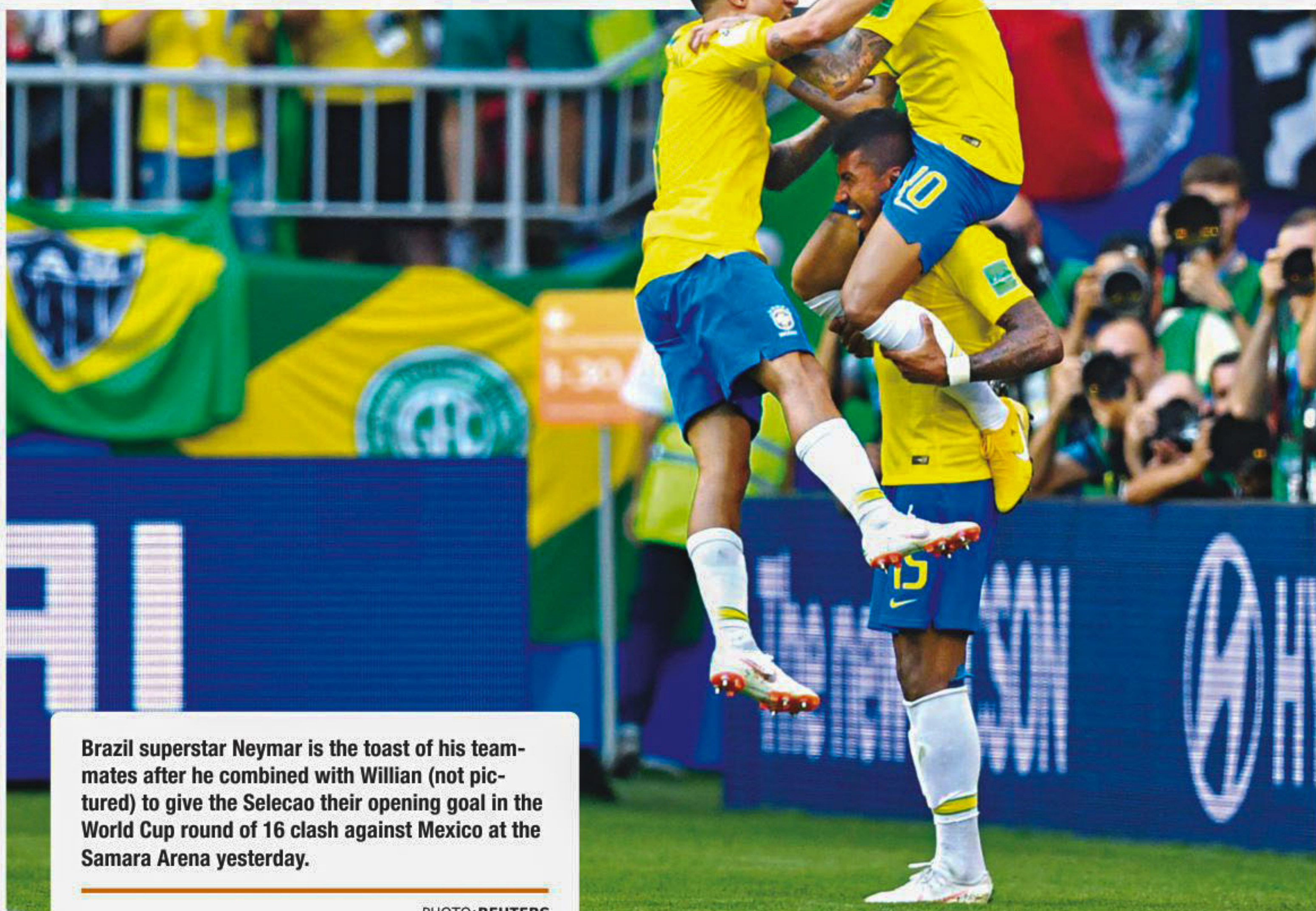
Brazil superstar Neymar is the toast of his teammates after he combined with Willian (not pictured) to give the Selecao their opening goal in the World Cup round of 16 clash against Mexico at the Samara Arena yesterday.