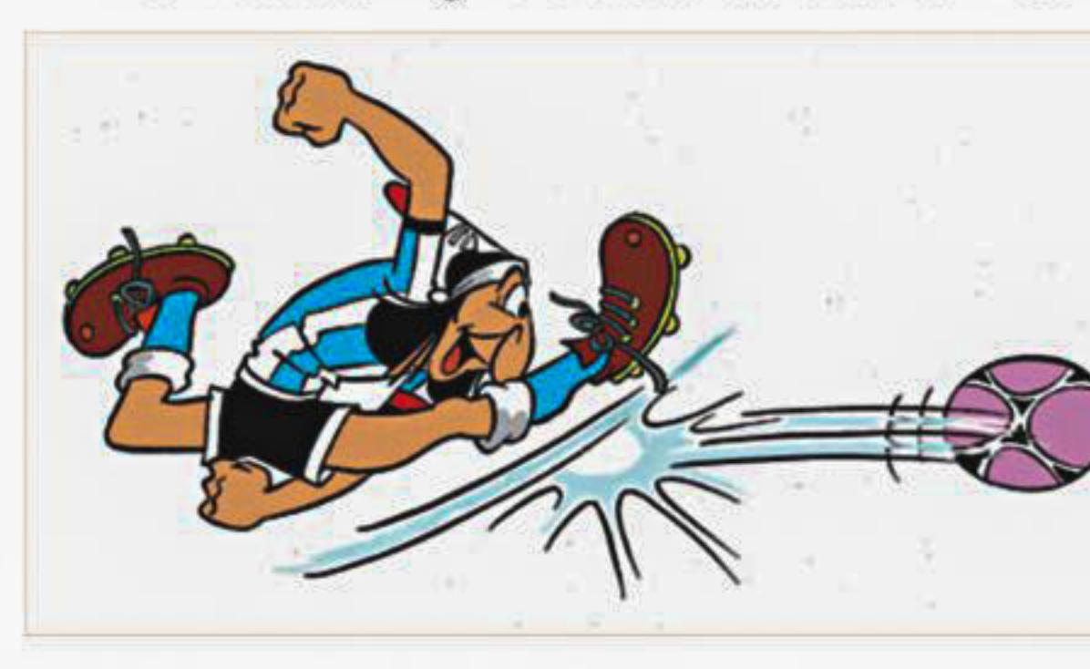
Argentine comic superhero Patoruzu.