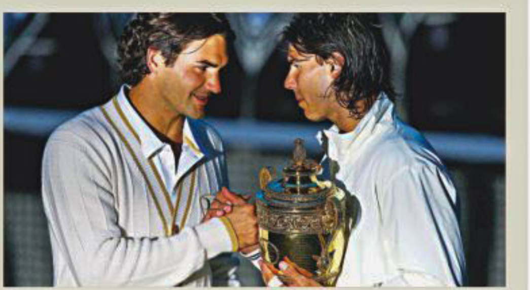
The 2008 Wimbledon final is widely considered the greatest match of all time.

standing rivalry. I have the same with Rafa," Federer said. "They're very different from one another. I guess there's some similarities there as well." "As similar as we are, Rafa and myself, we're still very different on many levels. I think it's pretty much the same for them." And, while Messi and Ronaldo have flopped out of the World Cup in Russia, with Argentina and Portugal both eliminated on Saturday, Federer