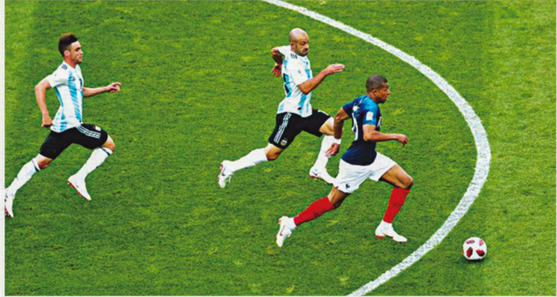
Kylian Mbappe was the talk of world football after this run in their round of 16 match against Argentina on Saturday. Mbappe reached a speed of 38kmph (Usain Bolt has the world record of 44.72) as he darted into the box, causing a desperate Marcos Rojo to concede a penalty.

AFP, Kazan France players and the world's press hailed Kylian Mbappe as an emerging superstar after the 19-year-old eclipsed Lionel Messi in a match that felt like the passing of a torch to a new generation. Mbappe's speed and power ruthlessly exposed Argentina's defence in Kazan in a thrilling 4-3 victory on Saturday that re-established France among the World Cup favourites. As one number 10 trudged off -- the player wearing an Argentina shirt with Messi's name on -- another in the blue of France took the plaudits. "Move over, Messi, a new global superstar is born at the World Cup," was the headline in the Sunday Times in Britain. "In this game, the Messi was him," French sports daily L'Equipe said above a photograph of Mbappe celebrating. "He showed his talent to the world and overshadowed Lionel Messi." The double strike made the boy from the Paris suburbs the first teenager since a 17-year-old Pele to score twice in a World Cup game. "He's got a lot more talent than me," France midfielder Paul Pogba said of Mbappe. "And he's not going to stop there. He's got so much talent." Argentina were simply swept aside by a new generation, and not just Mbappe -- another of France's scorers, Benjamin Pavard, is only 22 himself. "When you have players having a day like Mbappe had today, it's