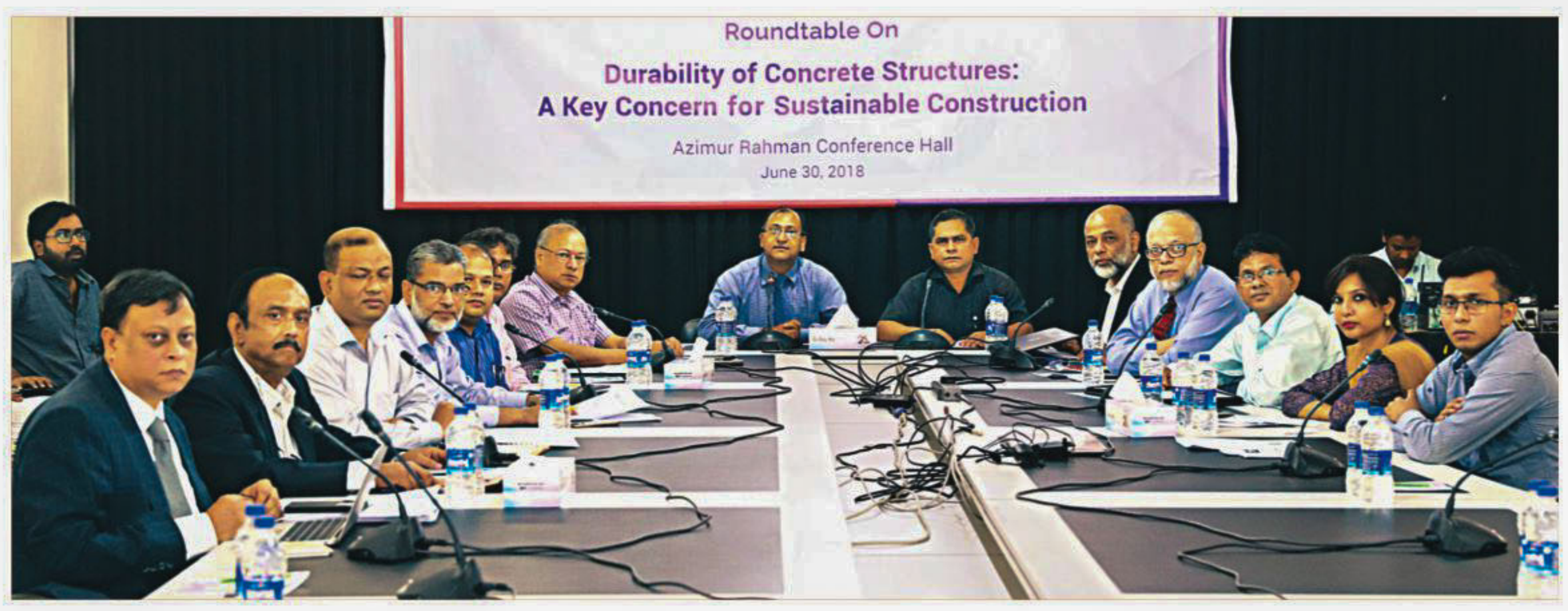
Experts attend a roundtable on durability of concrete structures at The Daily Star Centre in Dhaka yesterday.